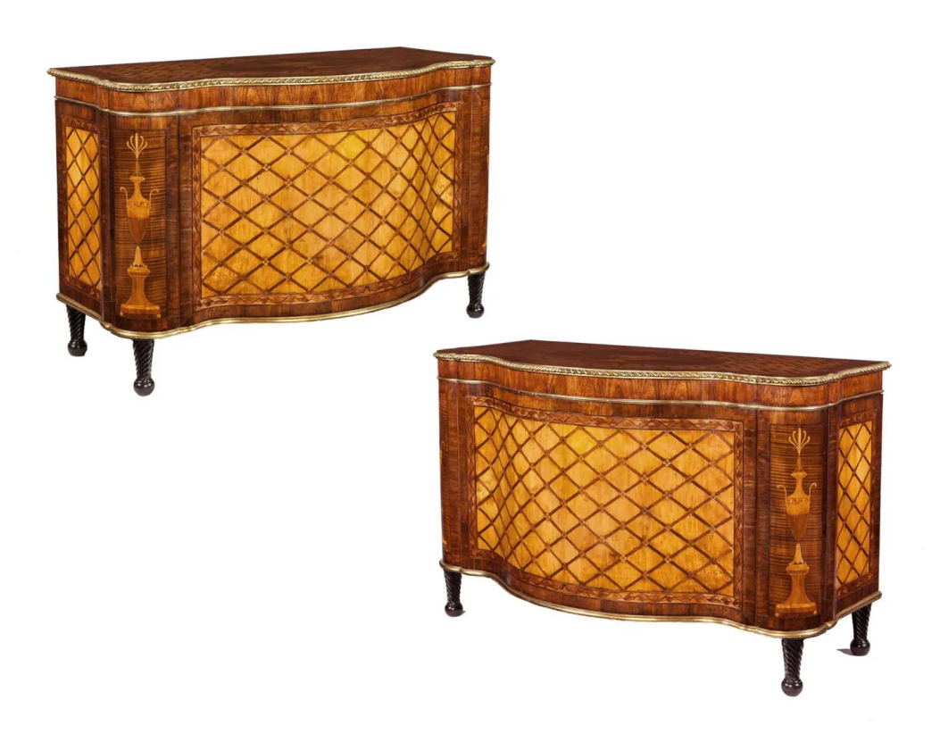
A pair of commodes attributed to Mayhew & Ince, circa 1775-78.

The 2021 online edition offers collectors and connoisseurs the opportunity to acquire and encounter an extensive range of works including paintings, photography, sculpture, tapestry, prints, ceramics, jewelry, arms and armor, antique furniture, and contemporary design. Dealers from around the world present exclusive art and objects, highlighting historically significant pieces by leading designers, artists, and makers in their respective fields.