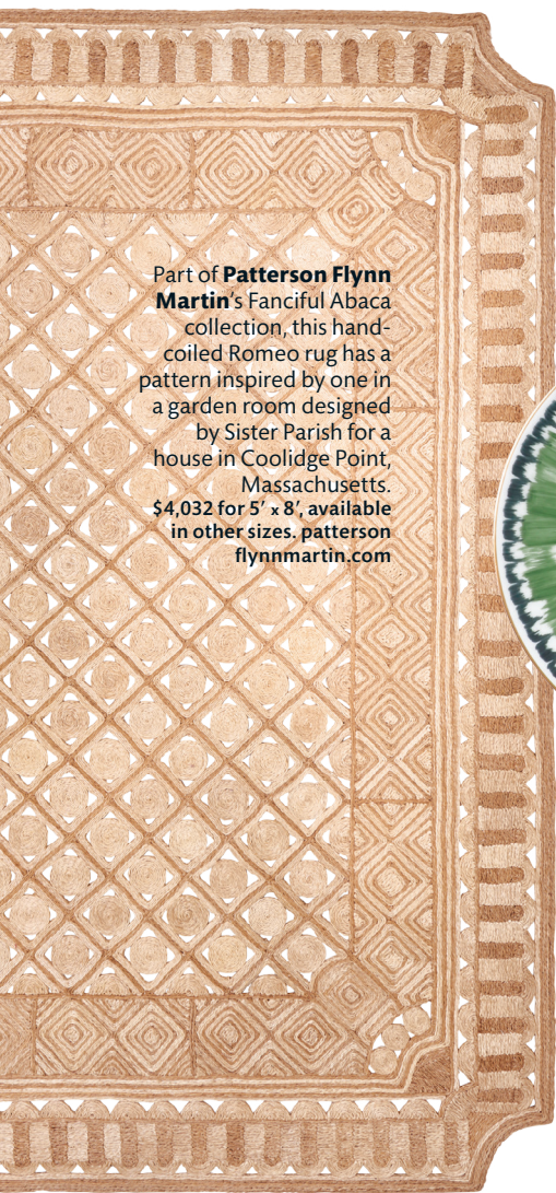
Part of Patterson Flynn Martin's Fanciful Abaca collection, this hand-coiled Romeo rug has a pattern inspired by one in a garden room designed by Sister Parish for a house in Coolidge Point, Massachusetts. $4,032 for 5' x 8', available in other sizes. pattersonflynnmartin.com