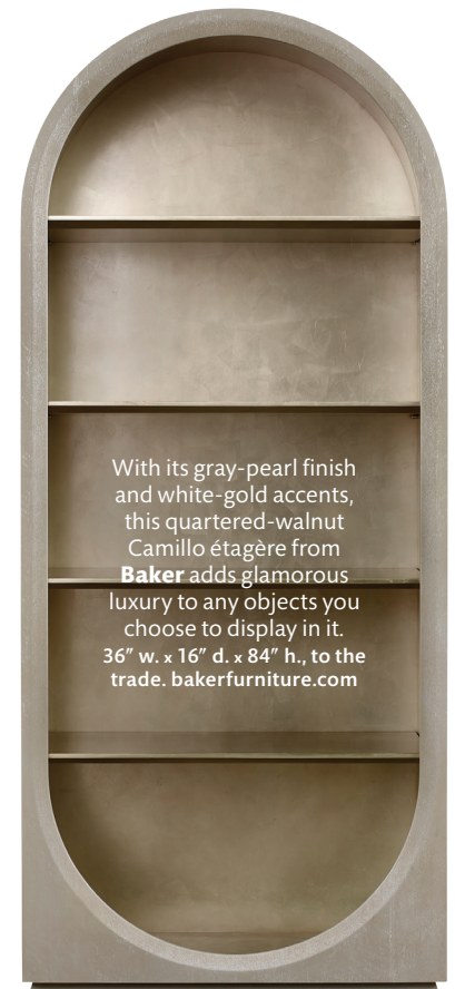
With its gray-pearl finish and white-gold accents, this quartered-walnut Camillo étagère from Baker adds glamorous luxury to any objects you choose to display in it. 36" w. x 16" d. x 84" h., to the trade. bakerfurniture.com