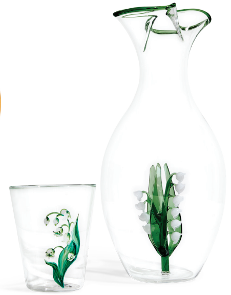
For the house's latest collection, Dior Maison designer Cordelia de Castellane applied lily of the valley, one of Christian Dior's favorite blooms, as a motif on serving pieces. From left: Glass, 3" h. x 4" w., $200; carafe, 10" h., $420. dior.com