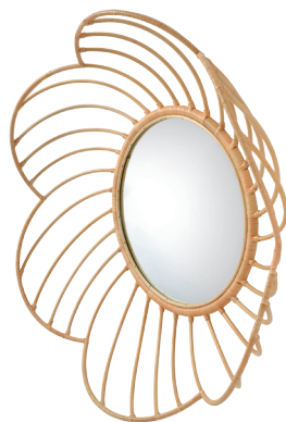
Bring the garden indoors with this Poppy mirror by Soane Britain , which features natural cane steam-bent in the brand's English workshop to craft its silhouette. 47" dia., available in other colors, $4,875. soane.com