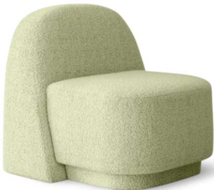
Melding sculptural strength with cozy softness, this bouclé Arp chair from Dmitriy & Co. embodies the brand's aesthetic of warm modernism. 31" w. x 31" d. x 30" h., available in other colors, $4,250. dmitriyco.com