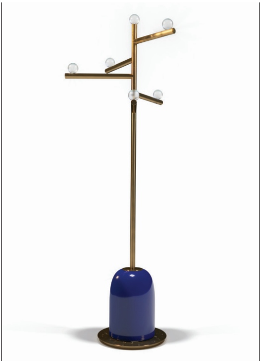
Piero Angelo Orecchioni’s array of Pins lighting and tables for Marioni , to which he just introduced a new lamp and a coat stand, recalls Italian humor of the 1980s Memphis movement. Made of glazed ceramic and satin-finish glass. $700–$2,700; marioni.it