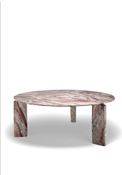
Massimo Castagna’s Giotto outdoor dining table for Exteta celebrates marble in a boldly sculptural way. It’s all carved stone (three types of marble available), imparting weight and volume within a lean profile. $44,750; ddcnyc.com