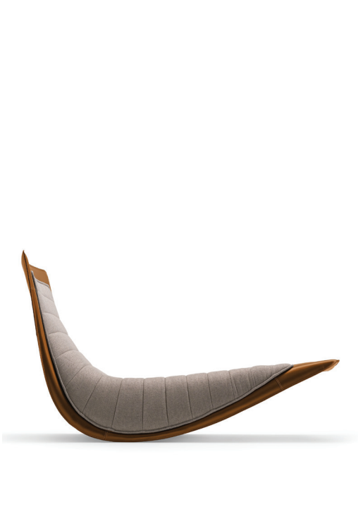
Zanotta’s 2020 Back to Emotions collection invokes a smile with the Rider lounge by Ludovica+Roberto Palomba. A simple leather-covered rocking seat with channelled upholstery resembles a roly-poly bug starting to curl up at the slightest touch. From $10,000; zanotta.it