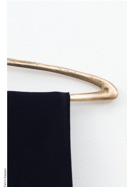
The 89 Series Omer Arbel, a multidisciplinary designer based in Vancouver and Berlin, created The 89 Series, a collection of brass hangers, the result of "hacked" 3D scans of typical everyday hanger shapes. oaoworks.com