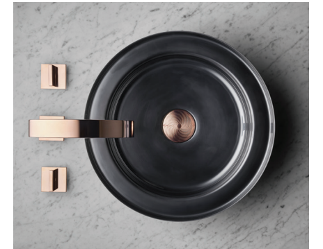
Bassines Narcis Round in Matte Black/Building a new dialogue between design and fine copperware, the industry and the craft.

After creating the brand image of La Cornue, the iconic French kitchen range manufacturer, Xavier Dupuy, has set himself a new challenge: to modernize fine French copperware. Bassines wash- basins are highly technological objects that find roots in the French high artisan tradition. bassines.com