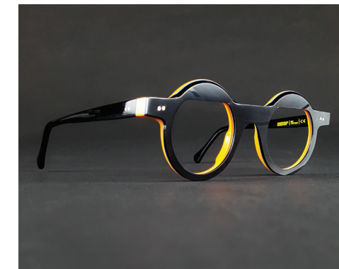
Vinylize The frame is a testament to the Bauhaus movement, which celebrated its 100th birthday this year. vinylize.com