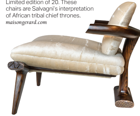
Amboseli Armchair by Achille Salvagni Atelier Walnut wood with cast bronze details and upholstered cushions. Limited edition of 20. These chairs are Salvagni's interpretation of African tribal chief thrones. maisongerard.com