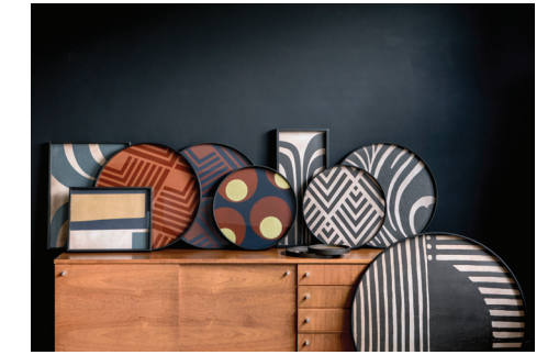
The Urban Geometry Collection from Notre Monde by Ethnecraft was inspired by the Art Deco architecture of Europe with influences from the 1970s. Symmetry, repetition and geometric patterns are streamlined with a monochromatic palette. All trays are either handpainted wood or glass. notremonde.com