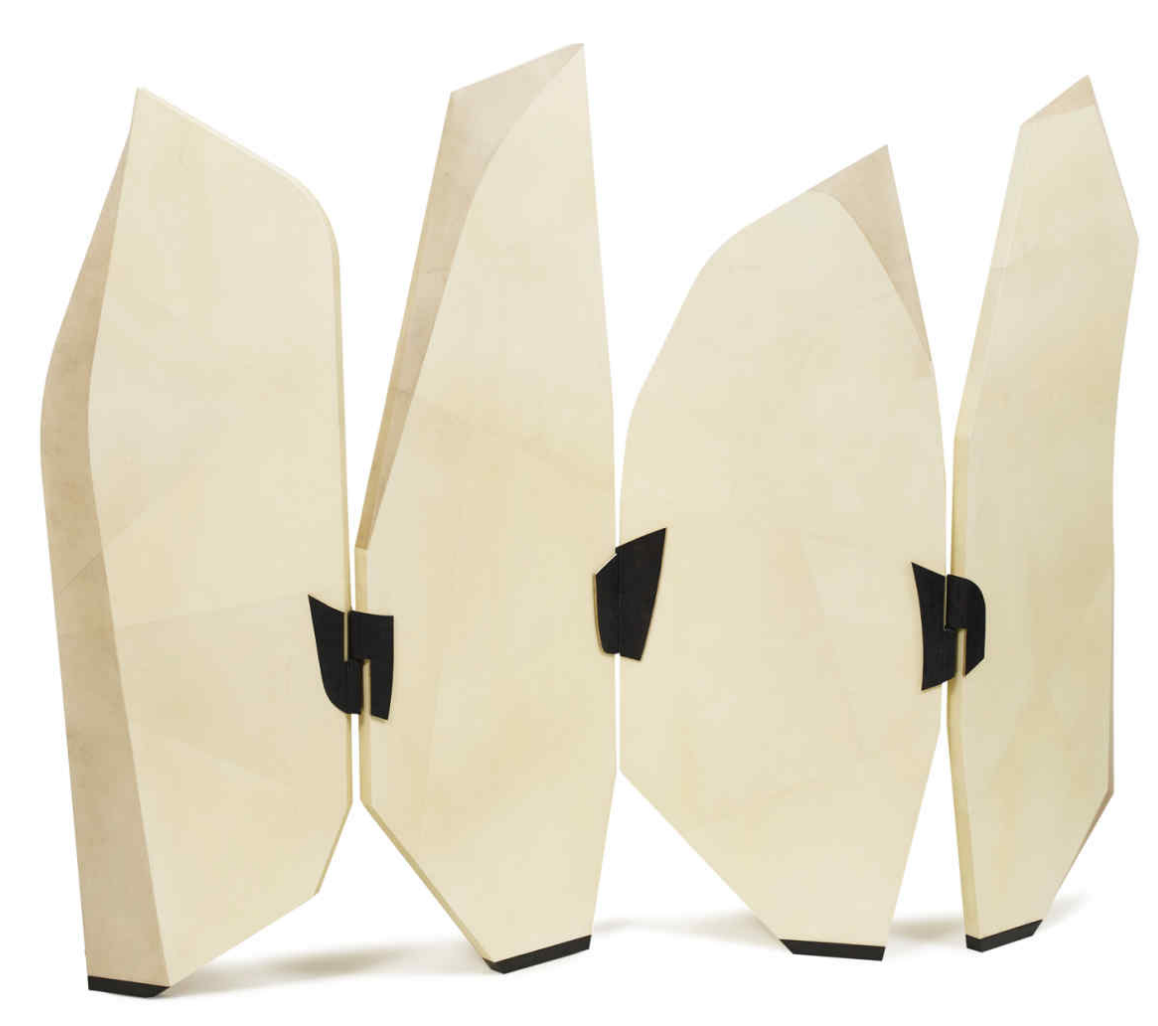
2016 parchment-lined Circeo screen with bronze hinges, €90,000

burnished bronze and onyx is also on view. But those visiting the show will, no doubt, have their imaginations drawn back to the sea – as the shape of the designer's parchment-lined Circeo screen (edition of three, \leq 90,000 ) brings to mind the sails of yachts as seen from shore.