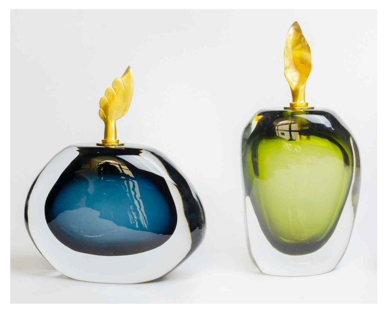
The Italian designer's new hand-blown Murano glassware – featuring Poseidone, Oceano and Tritone – is named after the deities of ocean and sea

Achille Salvagni's glamorous otherworldly aesthetic is being showcased at the inaugural PAD Monaco fair, which is in residence at the Grimaldi Forum until Sunday April 28. The Italian designer is presenting a new collection of handblown Murano glassware – a series of vase-cum-candleholders – named after the deities of ocean and sea: Poseidone, Oceano and Tritone (each in an edition of 20, €4,560). The fluid, organic forms glow in jewelled colours and are crowned with gold-enamelled cast-bronze flame-shaped finials.