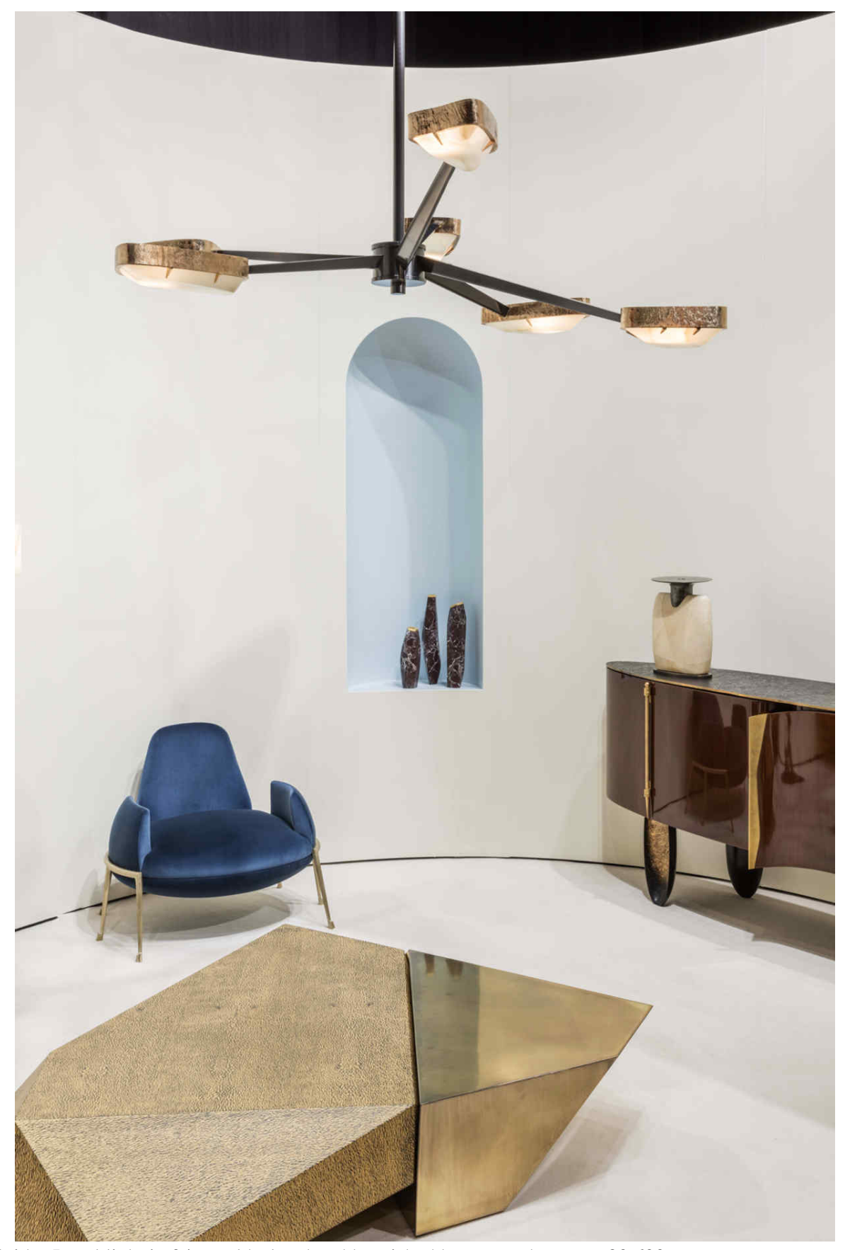
2015 Spider Jewel light in 24ct-gold-plated and burnished bronze and onyx, €93,600

Sculptural <u>lighting</u> is a Salvagni calling card, and a number of inventive creations are on display. Venezia (edition of 20, \leqslant 26,400), a backlit, hand-carved, block-shaped onyx sconce recalls the beauty of a faded <u>Venetian</u> wall, yet incorporates the latest LED technology, while the Thor (edition of 10, \leqslant 43,200) stands almost tip-toe-like on three burnished cast-bronze legs topped by onyx shades. The iconic Spider Jewel (2015, edition of 20, \leqslant 93,600) in 24ct-gold-plated and