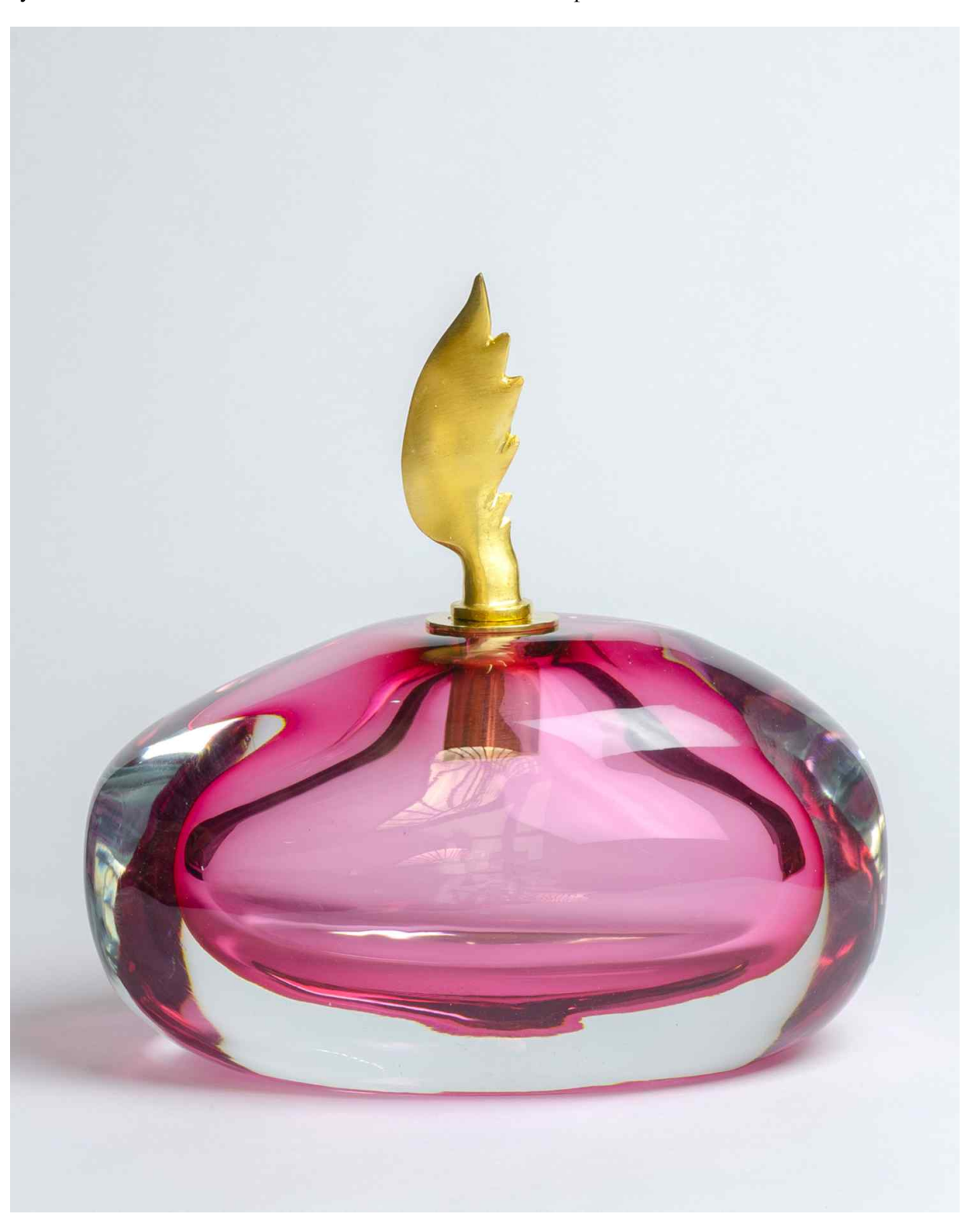
2019 hand-blown Murano-glass Aldus Tritone vase with gold-enamelled cast-bronze candle holder and flame-shaped finial, €4,560

Inspired by the ocean in fluid form, the vases-cum-candleholders are part of a showcase of covetable, collectable design