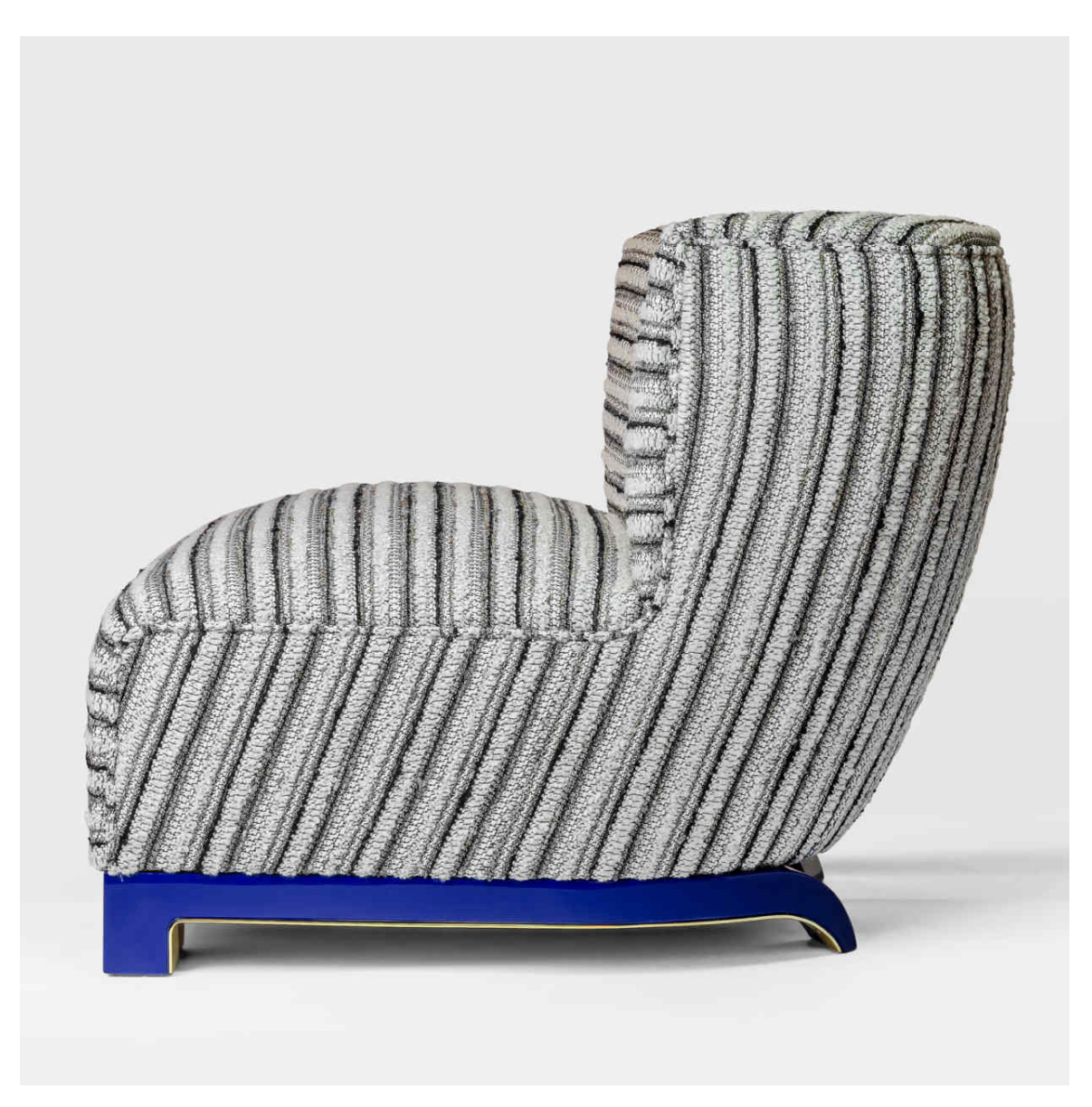
2013 Vittoria armchair, upholstered in velvet with lacquered wood and brass details, \leqslant 26,400