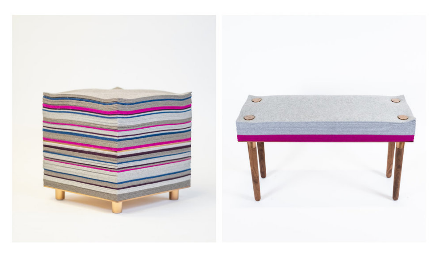
Layers of merino wool comprise an ottoman and side table designed by Jeffrey Forrest of STACKLAB and demonstrates that felt furniture is the ultimate in coziness.

"Consider natural light first. When selecting fixtures, if you use LEDs, invest in quality for your health. Pendants, sconces and floor lamps will give you a much more personal experience than recessed overhead lighting."