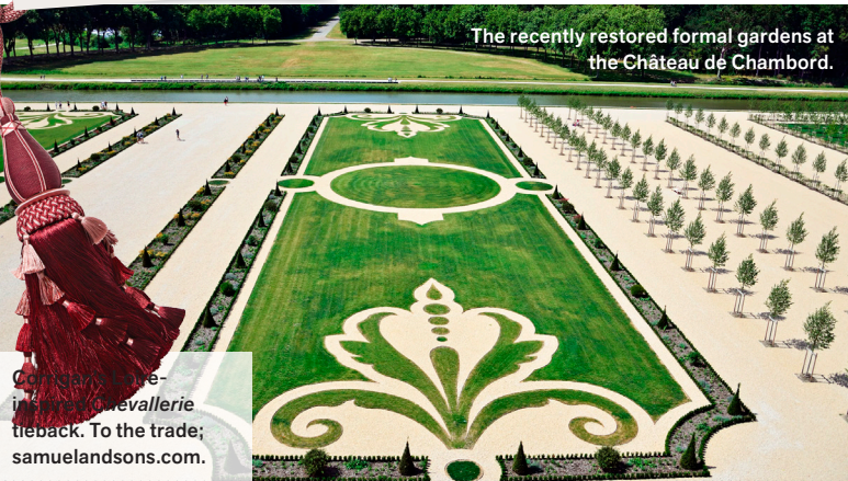
The recently restored formal gardens at the Château de Chambord.

Corrigan is featured in Decor magazine's "Reverberation" issue. To the trade; samuelandsons.com .