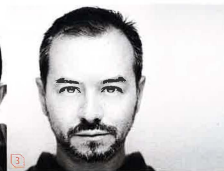
Toan Nguyen for Vibia

product Algorithm standout Rendered in hand-blown glass with a steel canopy, a flexible lighting system with no set configuration enables specifiers to create whatever they desire: a flock of birds, a constellation, or raindrops falling from the sky. vibia.com