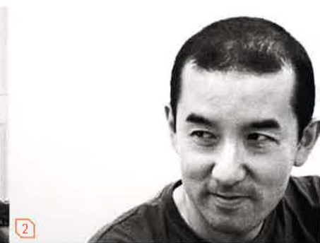
Kazuhiro Yamanaka for Pallucco

product Graffiti standout Part kinetic sculpture, part light, the fixture's fully moveable stainless-steel sticks allow for playful expression by the user. Through DDC. ddcnyc.com