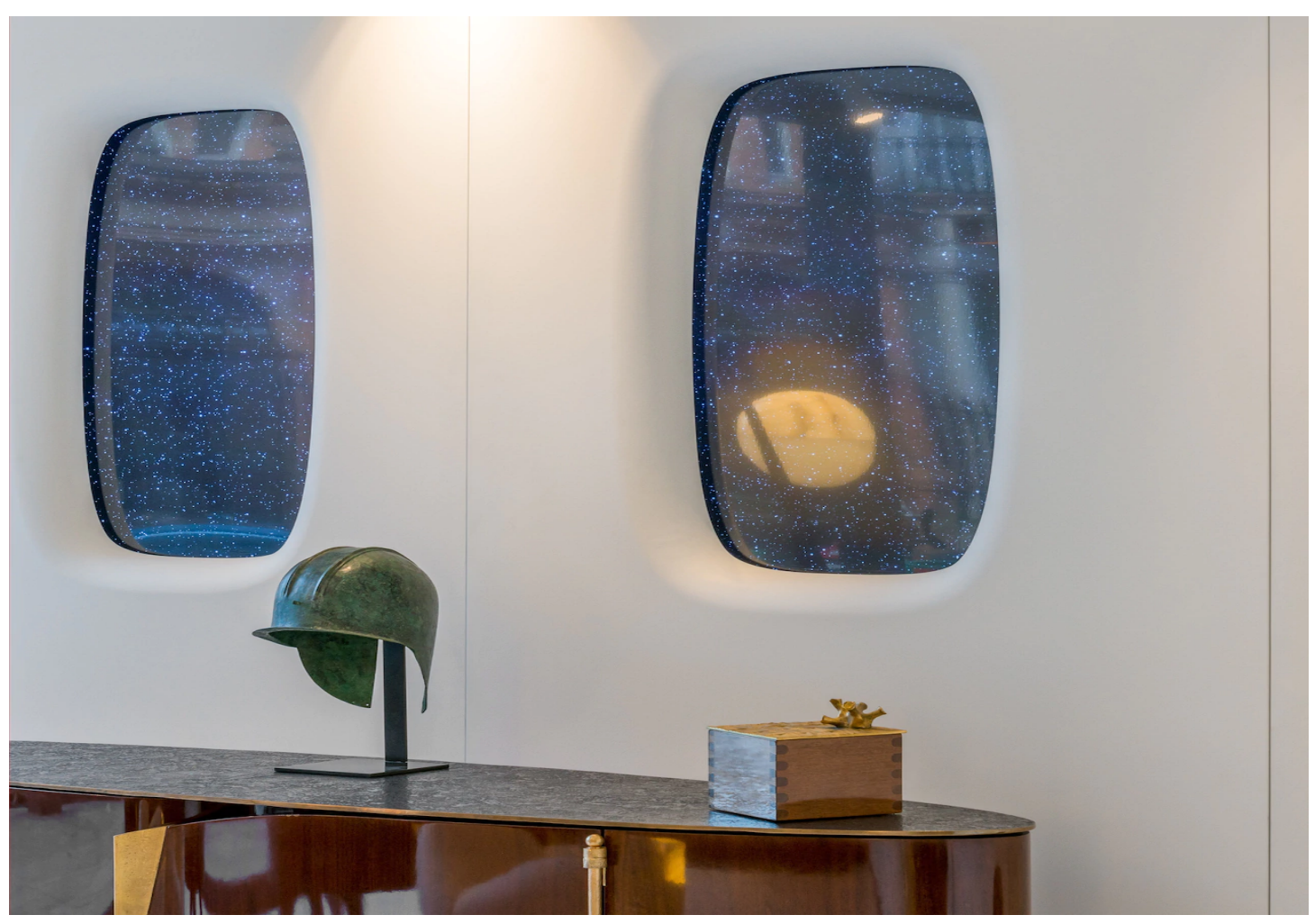
Paneled walls feature portholes seemingly looking out to space

What a vessel. In Salvagni's sumptuous retro-futuristic space capsule, inspired by set designs from iconic 1960s science fiction films, Stanley Kubrick's seminal 2001: A Space Odyssey (https://www.telegraph.co.uk/culture/photography/10755329/Behind-the-scenes-of-2001-A-Space-Odyssey.html) has landed in Grafton Street. With three new pieces as well as a fine selection of works from the designer's classic collection, the playful exhibit shows that far from being kitsch, a little lightheartedness can go a long way.