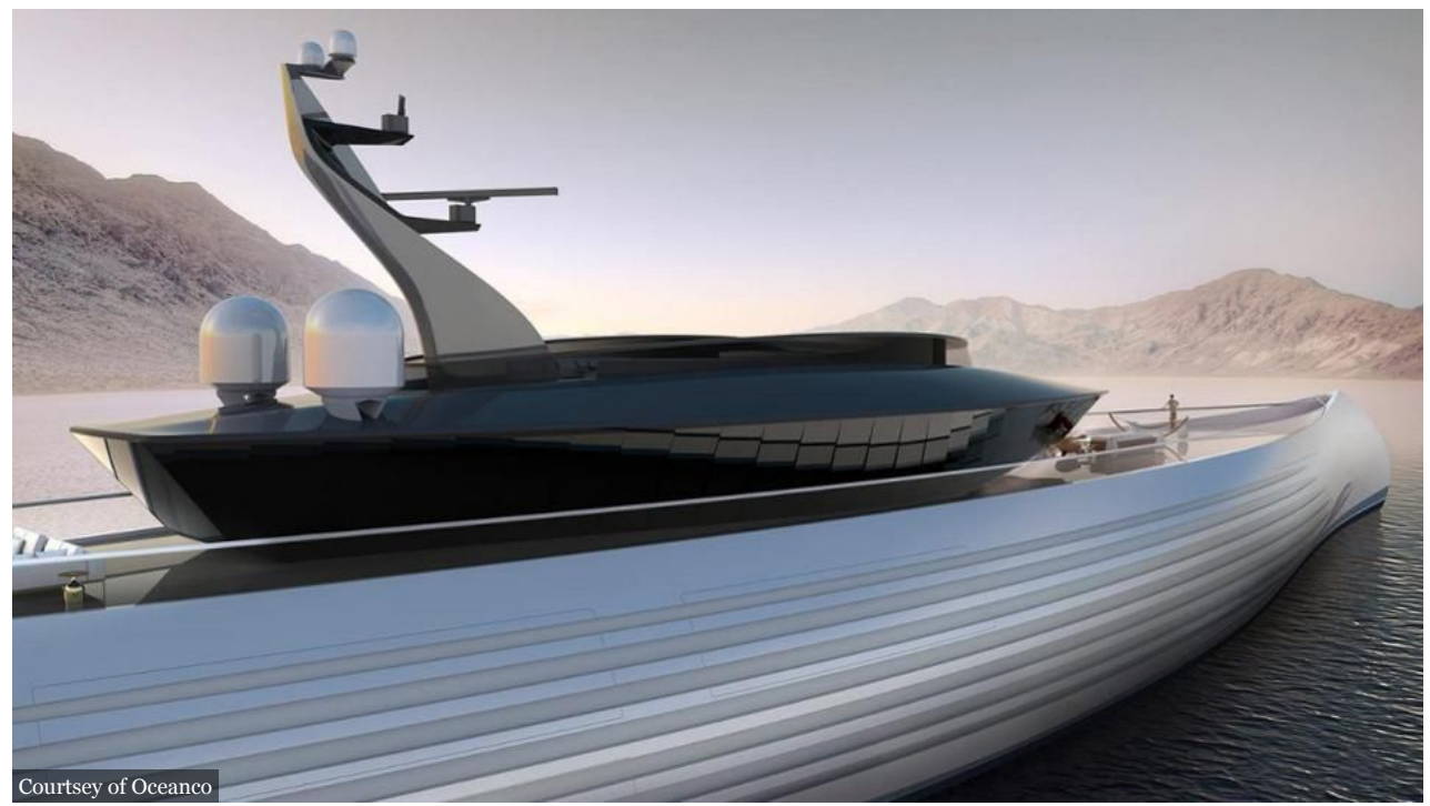
Tuhura by Oceanco

The exterior styling is reminiscent of early dugout canoes that the ancient Polynesians made across thousands of miles of open Pacific Ocean. And while this state-of-the-art yacht is designed to be a technological marvel with every conceivable comfort, the thinking behind the design was to celebrate our basic and primal desires to explore and discover. In fact, the actual name, 'tuhura' is derived from the Maori verb meaning: to discover, bring to light, unearth, open up, explore, and investigate.