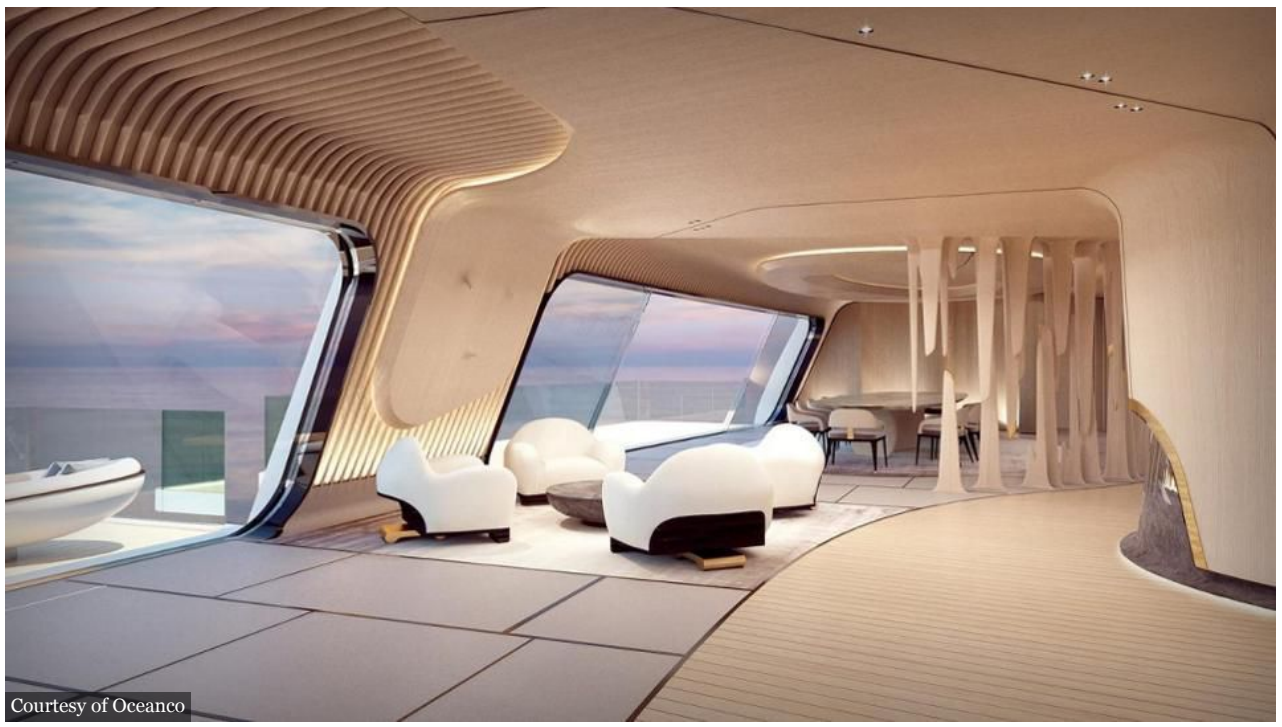
Tuhura by Oceanco

The exterior styling is reminiscent of early dugout canoes that the ancient Polynesians made across thousands of miles of open Pacific Ocean. And while this state-of-the-art yacht is designed to be a technological marvel with every conceivable comfort, the thinking behind the design was to celebrate our basic and primal desires to explore and discover. In fact, the actual name, 'tuhura' is derived from the Maori verb meaning: to discover, bring to light, unearth, open up, explore, and investigate.