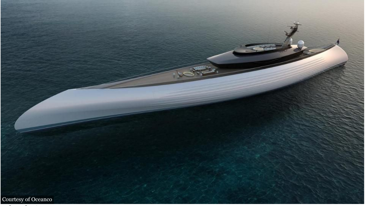
Tuhura by Oceanco

Opinions expressed by Forbes Contributors are their own.