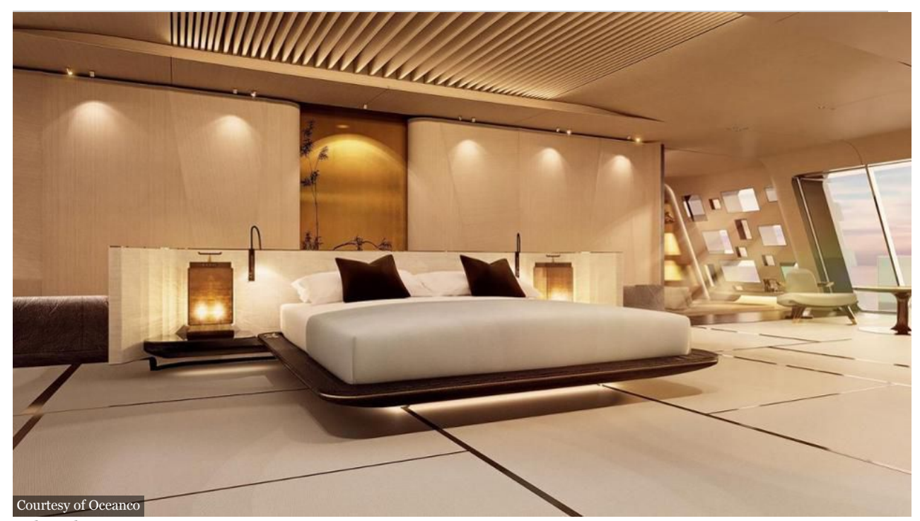
Tuhura by Oceanco

Tuhura 's hull and propulsion system have been developed in collaboration with BMT. The pure simplicity of the canoe form leads to a naturally efficient hull with low overall resistance, good seakeeping and excellent maneuverability.