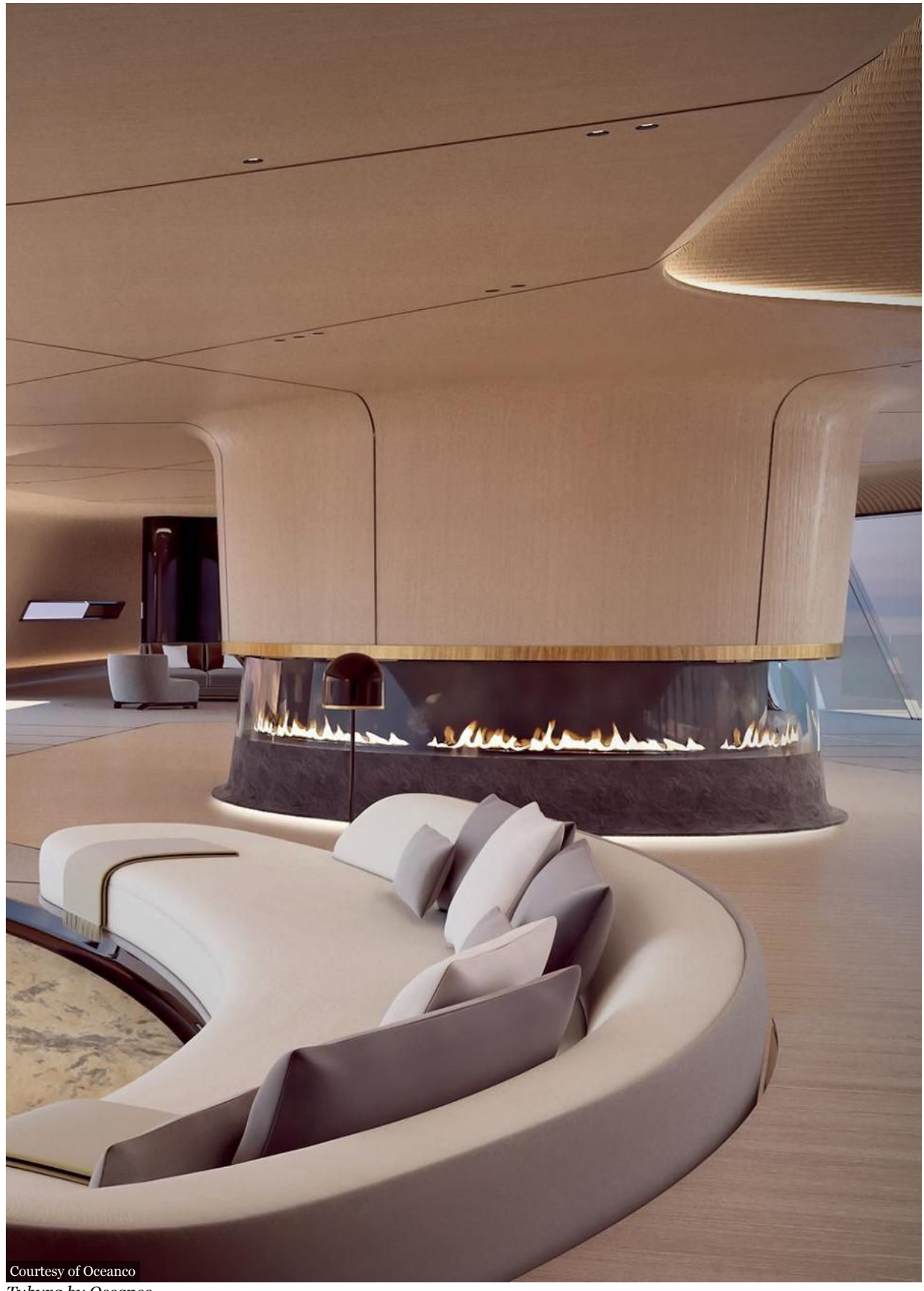
Tuhura by Oceanco

Creative thinking extends to all the systems aboard. LuxLab, the custom design label from Van Berge Henegouwen (VBH) has joined the team to ensure that this is an