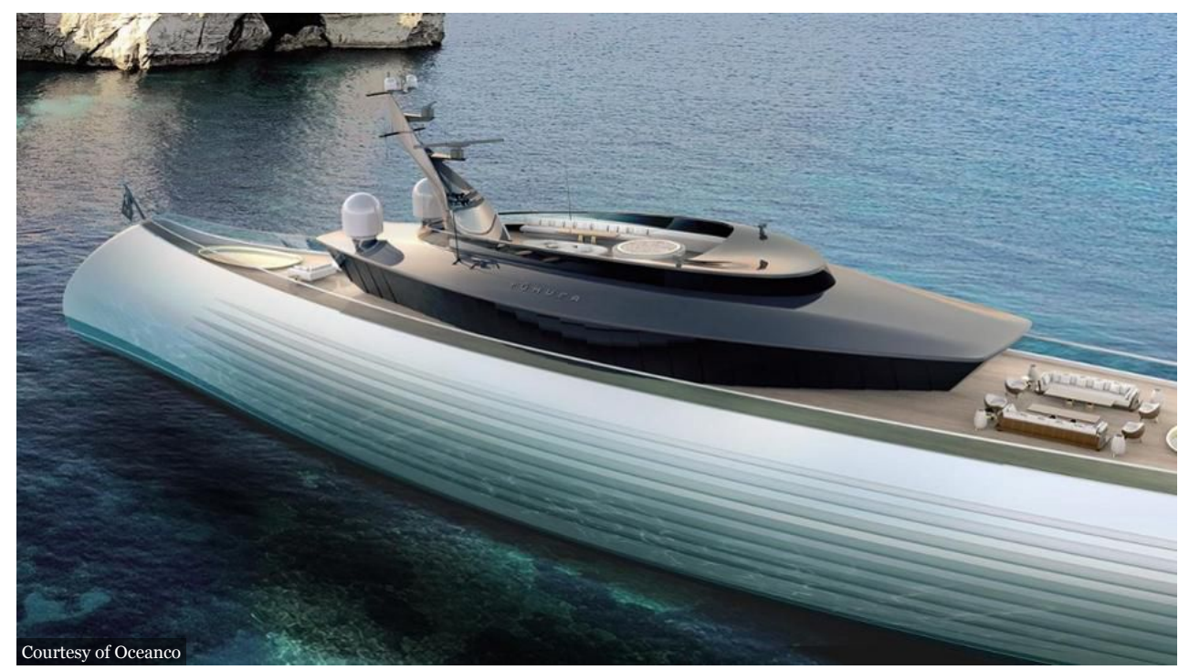
Tuhura by Oceanco

Innovation and cutting-edge technology is evident throughout the design. The hull has been conceived with multiple horizontal windows, utilizing an advanced glass technology that consists of a series of dots, allowing the view from within to be completely transparent, while from the exterior, the windows appear the same color as the hull, disguising their appearance. Glass features further in the impressive black superstructure made up of flat glass panels.