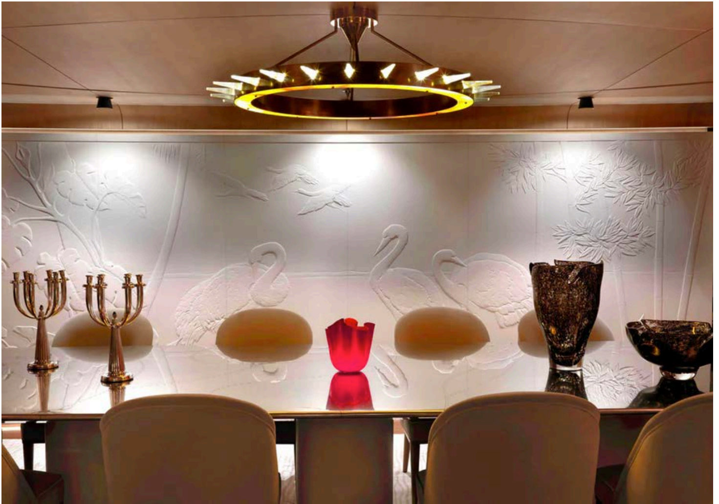
The dining area, with a custom light fixture and plaster mural.