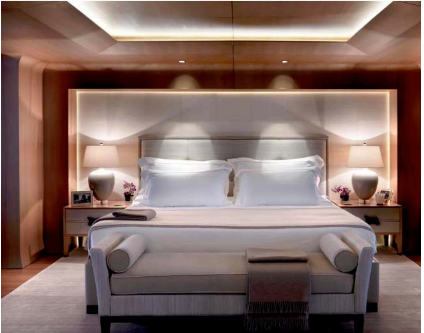
The master bedroom suite.