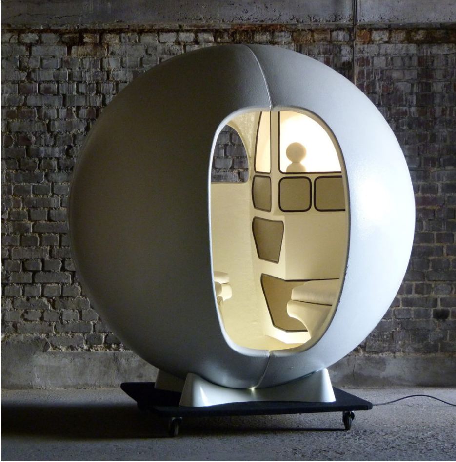
Maurice-Claude Vidili's Isolation Sphere , 1971.