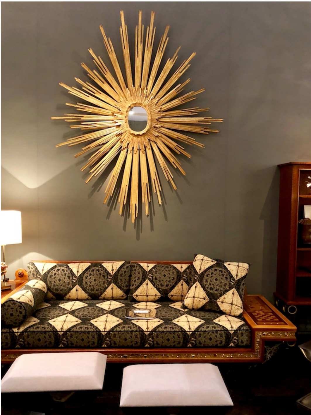
and Willow crystal and cast bronze chandelier from Thomas Pheasant