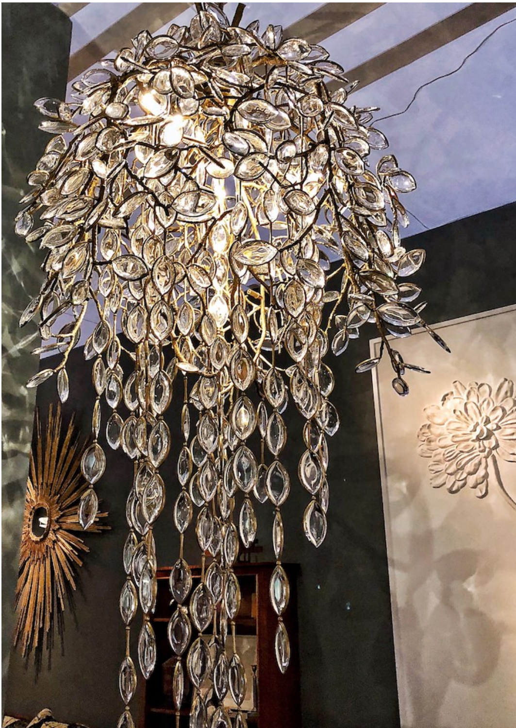
In Galerie Chastel-Maréchal , a wall of Line Vautrin mirrors hung like stars over a mid-century desk by French master Jean Royère.