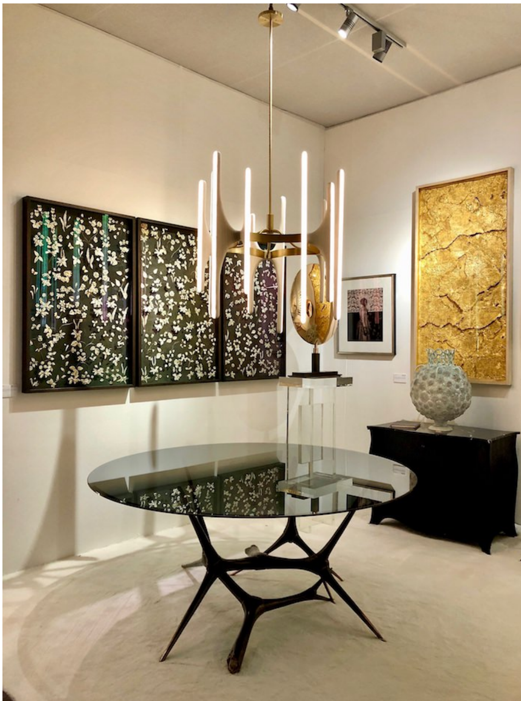
Below the hand-tooled flowers that are cast and gilded in yellow and white gold before being added to Coryndon's piece.