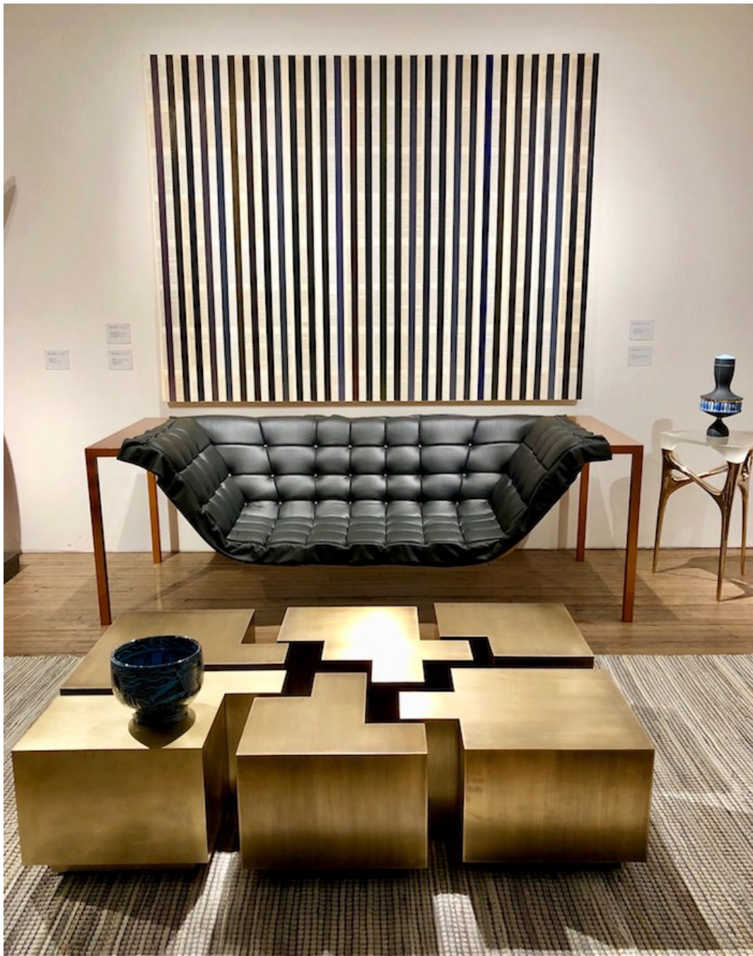
A close up of the Puzzle Table with Roberto Lugo's Hip Hop Bowl