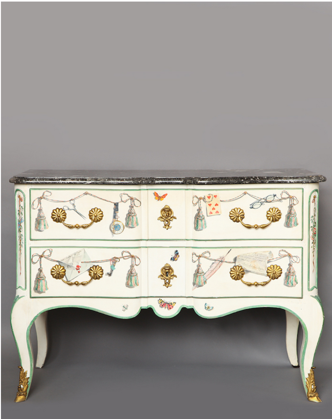
Swedish gallery Modernity showed a set of table and chairs by Eliel Saarinen designed in 1907 for the Munksnas hotel in Finland