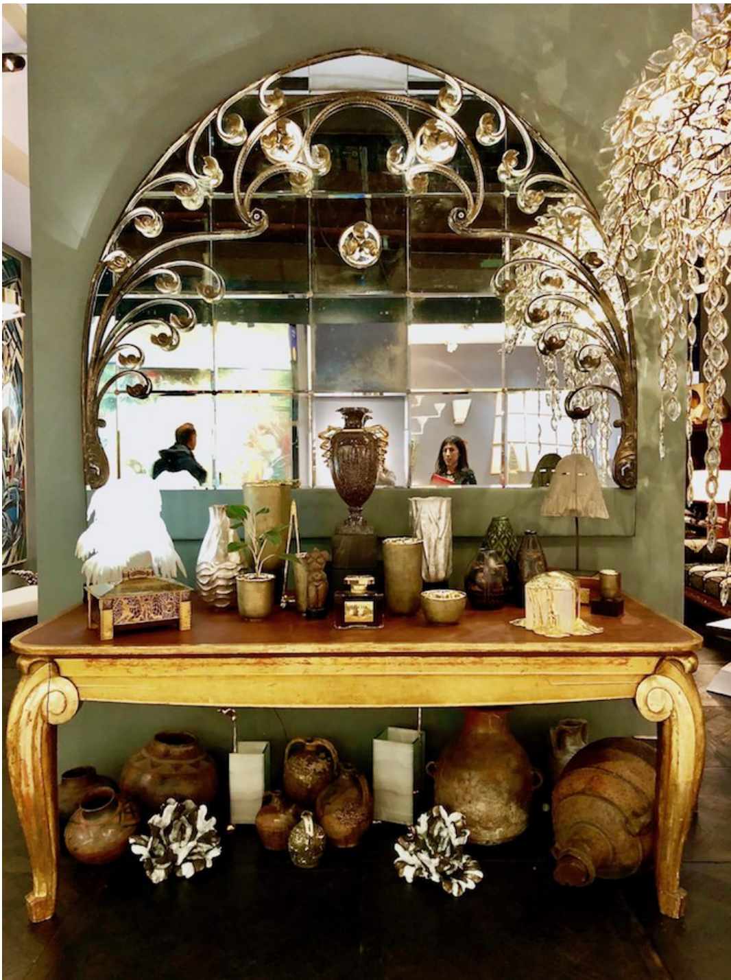
a 1984 Pucci de Rossi orientalist style sofa, upholstered in velvet surrounded by faux marbled wood and intricate marquetry