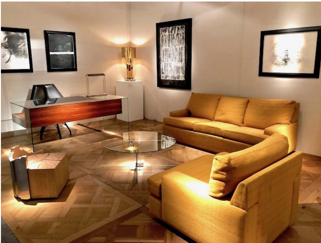
Philippon and Lecoq sofa, chair and amazing desk, below, shown with a Pierre Paulin leather chair.