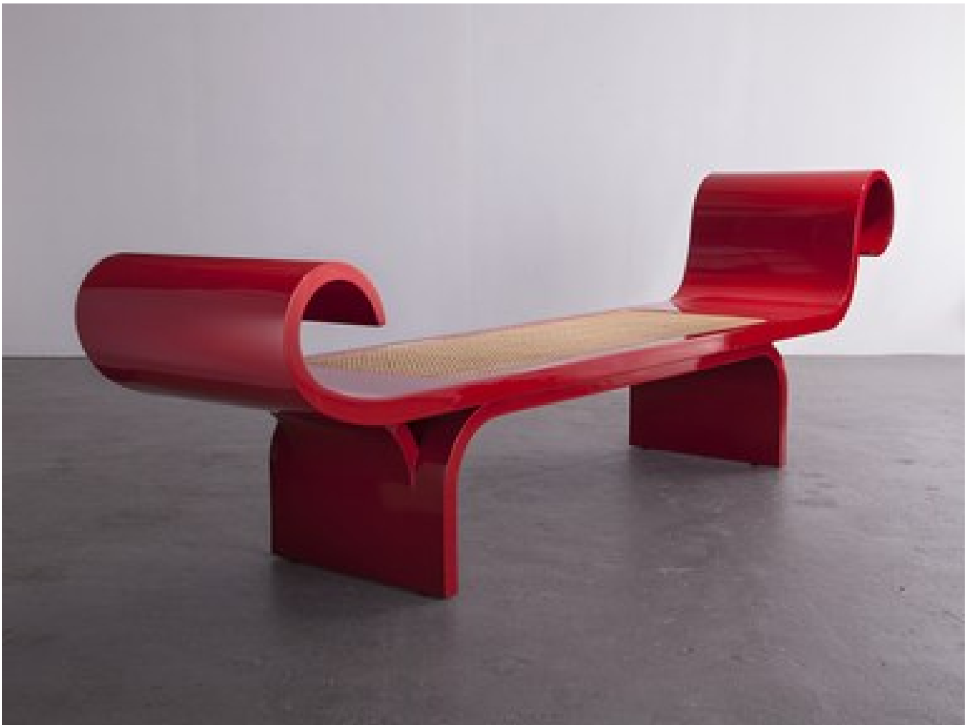
An Oscar Niemeyer bench on display at Expo Chicago.