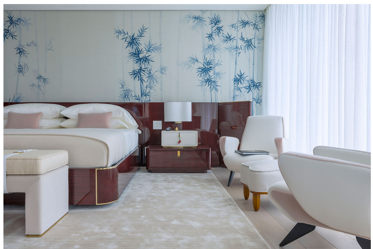
A subtle abstract floral pattern used above the bed creates a mural-like accent in this bedroom designed by Rome-based architect and designer Achille Salvagni.

"Another interesting way to use wallpaper is sparingly—above a dado rail or wood paneling, for example, to give just a touch of color and print to the room. I often use it to highlight the back of an alcove or as a border."