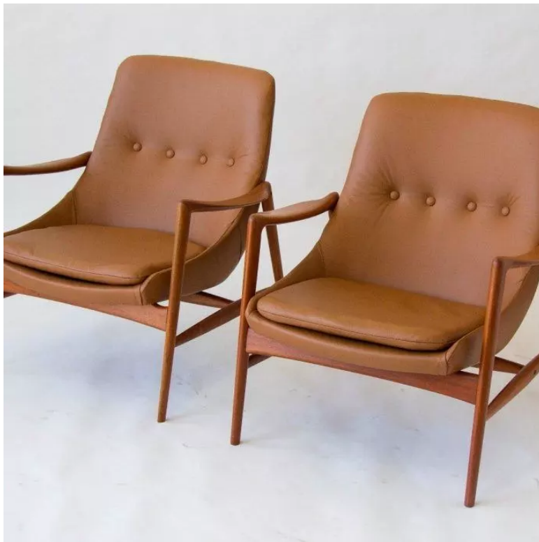
Rastad and Relling Lounge Chairs — Den Mobler, Los Angeles, CA

We're leaning in on Pantone pink with this ladylike loveseat. Wormley is celebrated for marrying traditional silhouettes with the mid-century modern aesthetic of his era. The result is a cute and curvaceous sofa with personality — like a best friend always ready with rose.