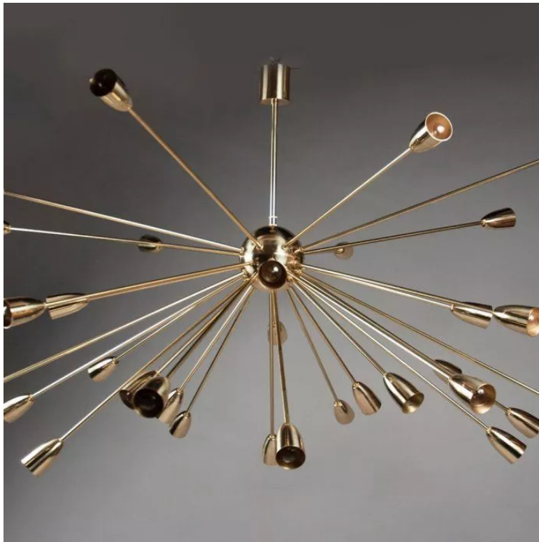
Sputnik Chandelier — Bernd Goeckler, New York, NY

Something sparkly is required for a fantasy living room, so why not this 1950s Italian Sputnik chandelier? With slender, polished brass arms, this fixture adds the final touch.