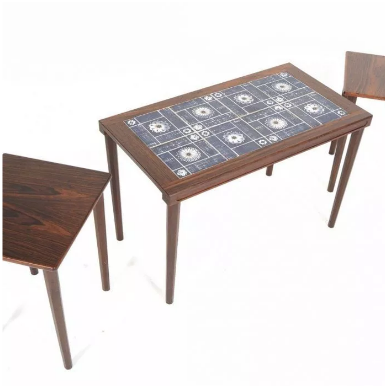
Danish Nesting Tables — Mid Century Mobler, Berkeley, CA

If you're spill-prone like myself, the geometric floral tiles decorating these rosewood nesting tables prove both functional and beautiful. The tile's distressed blue glaze also radiates true bohemian flair.