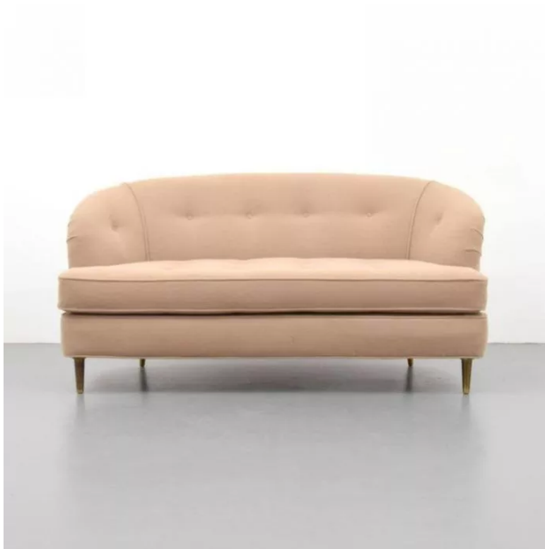
Edward Wormley Loveseat — Objects20c, West Palm Beach, FL

We're leaning in on Pantone pink with this ladylike loveseat. Wormley is celebrated for marrying traditional silhouettes with the mid-century modern aesthetic of his era. The result is a cute and curvaceous sofa with personality — like a best friend always ready with rose.