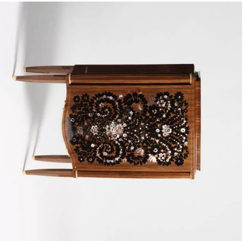
Leleu Fireworks Cabinet — Maison Gerard, New York, NY

The platform is searchable by category and style — perfect for a little fantasy window shopping. Of course, I dived in, and quickly found a dream mix of mid-century modern and Art Deco — definite bookmarks for that eclectic living room I hope to have one fine day. Check out these delectable finds below.