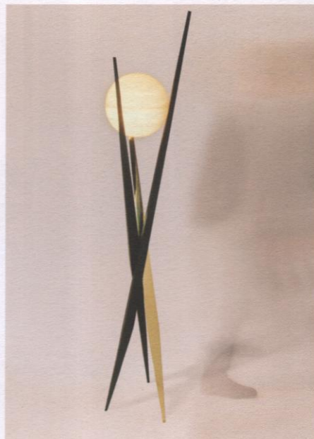
Backlit handcarved onyx and bronze piece from Achille Salvagni Atelier

'When it became clear that I wouldn't be able to organise and set up my shows in someone else's gallery with complete freedom, I decided to open my own space right in the heart of London,' he explains. 'If Rome is the best place in the world to find inspiration and create, London is the best window in Europe, the best place to show my work. It's culturally diverse and international in spirit, making it the best platform to connect with my high-end clientele.' achilleslavagni.com