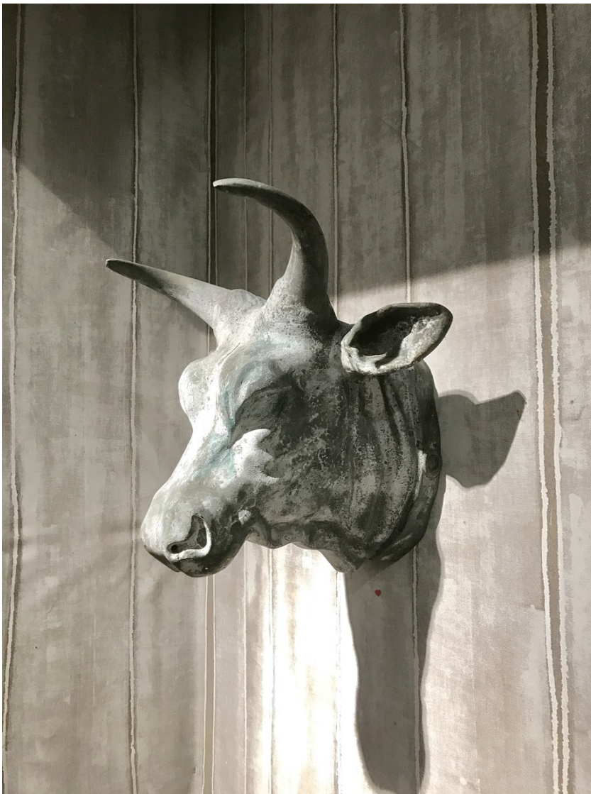
An English butcher's trade sign.