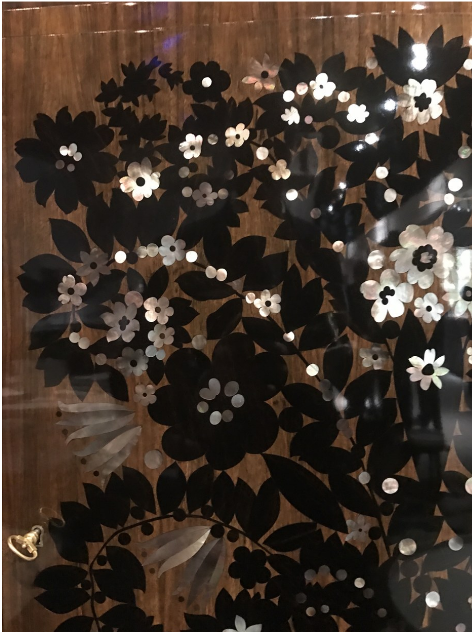
Maison Gerard's Fireworks cabinet by Jules Leleu.

All those items were still in play by the time the Champagne stopped flowing, but here's a short list of what some of opening night's guests admired and paid for.