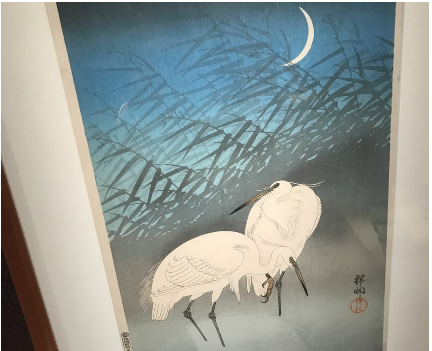
A 1926 Ohara Koson woodblock print.