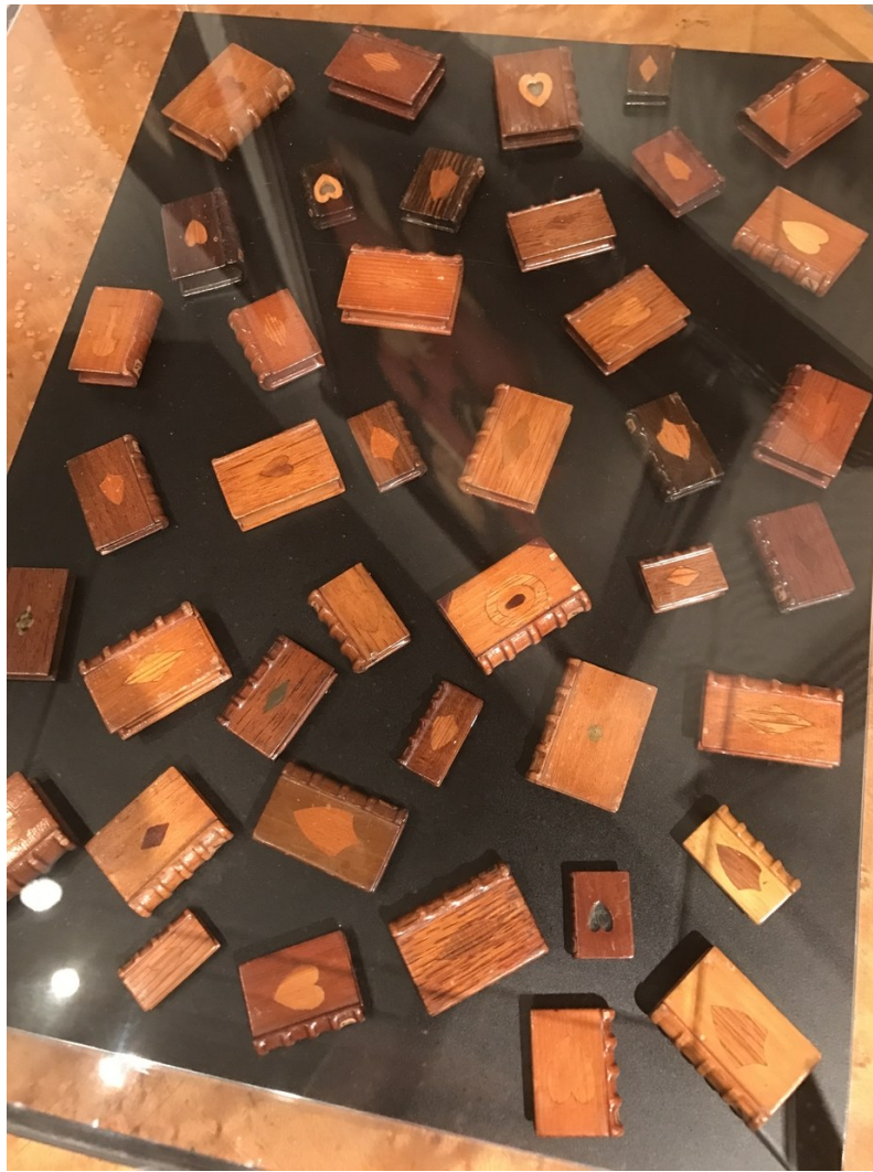
A collection of 41 tiny book-shaped whimsies.

A collection of 41 tiny book-shaped whimsies, made in America in the mid- to late 19th century. The largest measures only 1.5 inches by 1 3/16 inches by 3/8 inches.