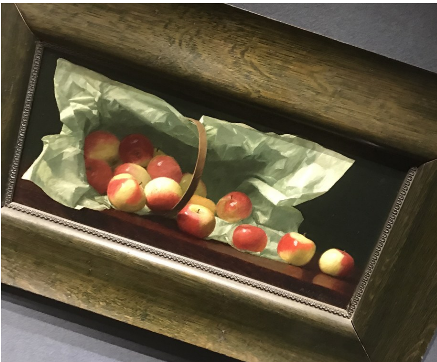
Apples in a Basket.