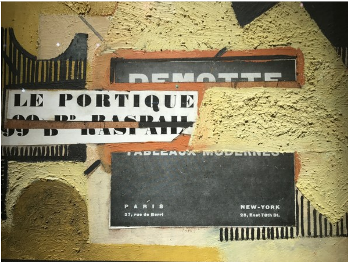
Suzy Frelinghuysen's Composition .