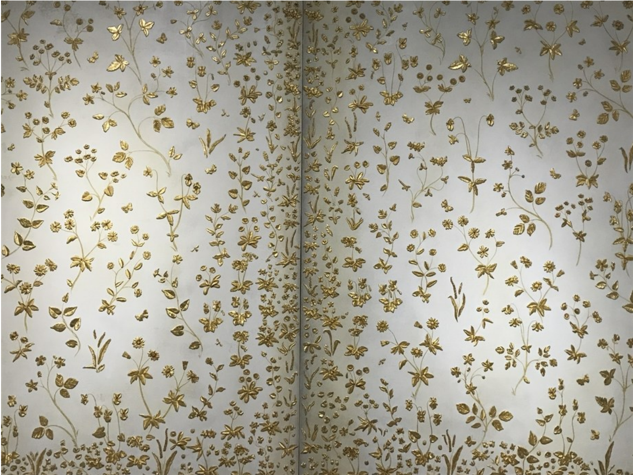
Book of Flowers diptych.

Three collectors fell madly in love with Book of Flowers , a grand and glittering diptych by British artist Sophie Coryndon , who dappled two ivory-gessoed panels with a meadow of wildflowers made of cast plaster that she had carved and gilded in emulation of 16th-century gold-thread embroidery. The piece, measuring 72 inches long by 102 inches tall, sold for $48,000—but the two other impassioned visitors paid richly too, placing orders for the work to be replicated.