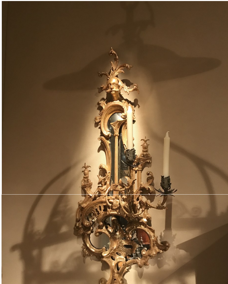
A gilt-wood girandole by Thomas Johnson at Ronald Phillips.