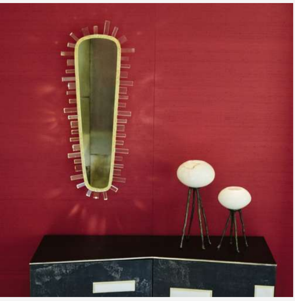
The Valentine Magnum mirror that Salvagni designed for Achille Salvagni Atelier.