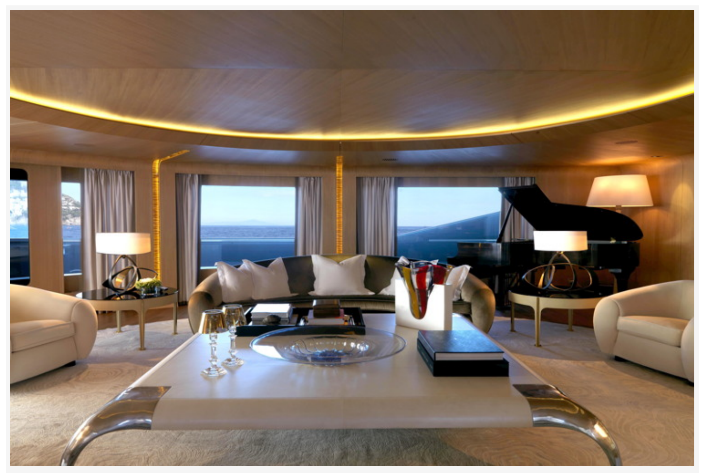
Salvagni's design for a rounded living room on a yacht.