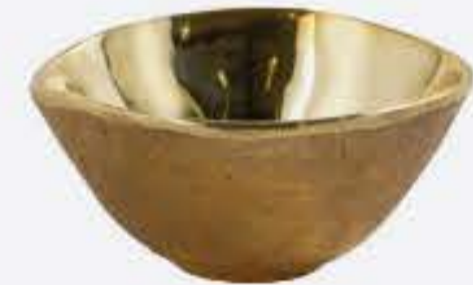
Jaimal Odedra bronze Rupi bowl, 2015.

"Some of my favorite pieces are Jaimal Odedra's polished bronze vessels. One of the characteristics of this collection is the use of the traditional Moroccan sand-casting technique while creating very modern and free-form vessels."