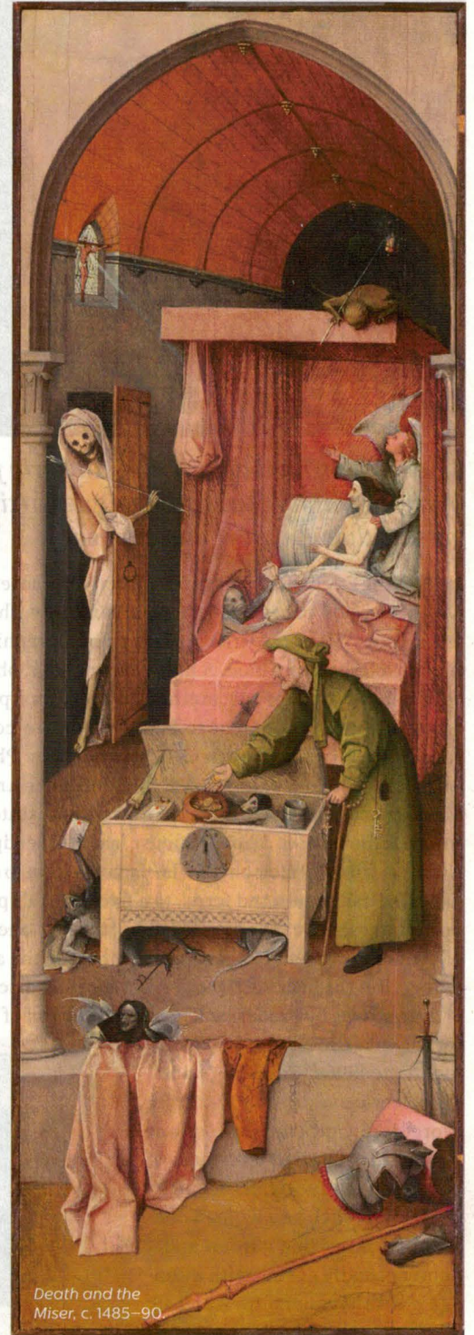
Death and the Miser, c. 1485–90.

Hieronymus Bosch was a pious, hardworking painter with a wild and weird imagination. Living in the Dutch town of 's-Hertogenbosch, he rendered angels and devils, saints and sinners in phantasmagorical arrays. To mark the 500th anniversary of his death, nearly all of his panels and drawings will return from museums around the globe to the town's Noordbrabants Museum for a landmark exhibition—part of a yearlong celebration that includes Bosch-inspired dance and theater performances (February 13–May 8; hnbm.nl).