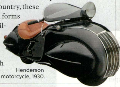
Henderson motorcycle, 1930.

Transportation may not seem particularly luxurious in these days of congested highways and road rage, but in the late 1920s and '30s, automakers strove to produce sleek and futuristic models, transforming functional metal machines into exquisite pieces of art. This winter, Houston's Museum of Fine Arts is displaying 14 cars and three motorcycles as part of "Sculpted in Steel," an exhibition highlighting the advances made in automotive design throughout the Art Deco period. Gathered from public and private collections around the country, these models reflect the aerodynamic and streamlined forms that were so prevalent during that time, from a silver Talbot-Lago Teardrop Coupe with striking red fenders to a custom black Henderson motorcycle with a lustrous chrome grille to the ultra-rare Stout Scarab, a proto-minivan equipped with a table (February 21–May 30; mfah.org).