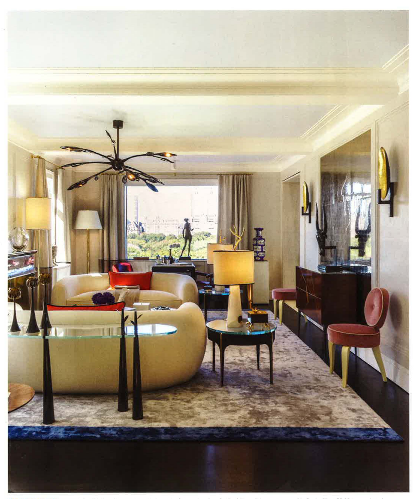
CHIC CHAMBERS ABOVE: The silk, hand-knotted rug designed by Salvagni and crafted in Tibet adds structure, and is flanked by a Hobbit console in bronze and glass and Tomaso Buzzi side chairs with parchment legs and velvet upholstery. The peacock wall sconce by Herve Van der Straeten is from Maison Gerard. OPPOSITE, TOP: The breakfast table was designed by Salvagni for the client and is surrounded by sculptural chairs by Jean Royère. The Artic Pear chandelier from Ochre hovers above. OPPOSITE, BOTTOM: A cabinet by Salvagni is inspired by the Roman Colosseum.