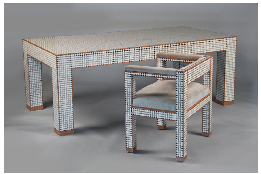
N-10154 desk and chair by Ado Chale (b 1928), Belgium, 1965-70, from Bernd Goeckler Antiques, on eBay Collective

Designers and consumers alike can shop by category (seating, tables, case pieces and beds, decorative objects, lighting, fine art, Asian antiques, silver, sculptures and carvings); by dealer; by style (Scandinavian Cool, The Country House, Artful Decor, The Manor Reborn, American Classics and Eastern Influence); and via a dedicated editorial section called Design Inspiration from Architectural Digest . A Shop the Look feature, using image-recognition software, lets users hover over an image on the site, which in turn searches matching inventory across eBay. Among the goods that made their debut with eBay Collective's launch: a pair of Giò Ponti armchairs; a Mies van der Rohe chaise lounge in original leather; a cabinet attributed to Osvaldo Borsani ; a rare, signed Andy Warhol "Mao" exhibition screenprint; and a desk and chair by ADO CHALE .