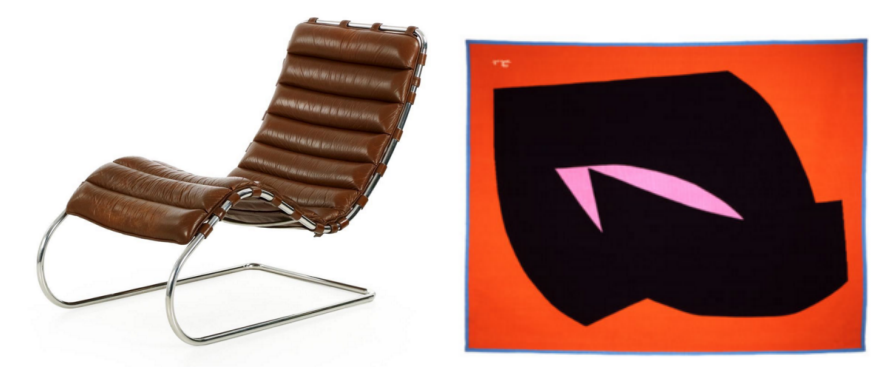
Ludwig Mies van der Rohe for Knoll MR chaise lounge from Silla Fine Antiques; Original Jan Yoors, Orange Diamond, Tapestry, USA, 1970s, from Todd Merrill Studio; on eBay Collective

Designers and consumers alike can shop by category (seating, tables, case pieces and beds, decorative objects, lighting, fine art, Asian antiques, silver, sculptures and carvings); by dealer; by style (Scandinavian Cool, The Country House, Artful Decor, The Manor Reborn, American Classics and Eastern Influence); and via a dedicated editorial section called Design Inspiration from Architectural Digest . A Shop the Look feature, using image-recognition software, lets users hover over an image on the site, which in turn searches matching inventory across eBay. Among the goods that made their debut with eBay Collective's launch: a pair of Giò Ponti armchairs; a Mies van der Rohe chaise lounge in original leather; a cabinet attributed to Osvaldo Borsani ; a rare, signed Andy Warhol "Mao" exhibition screenprint; and a desk and chair by ADO CHALE .