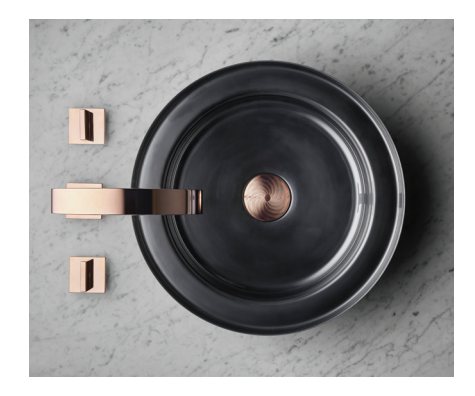
Bassines Narcis Round in Matte Black/Building a new dialogue between design and fine copperware, the industry and the craft.