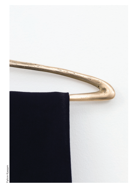
The 89 Series

Omer Arbel, a multidisciplinary designer based in Vancouver and Berlin, created The 89 Series, a collection of brass hangers, the result of "hacked" 3D scans of typical everyday hanger shapes. oaoworks.com