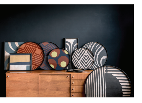
The Urban Geometry Collection from Notre Monde by Ethnicraft was inspired by the Art Deco architecture of Europe with influences from the 1970s. Symmetry, repetition and geometric patterns are streamlined with a monochromatic palette. All trays are either handpainted wood or glass. notremonde.com