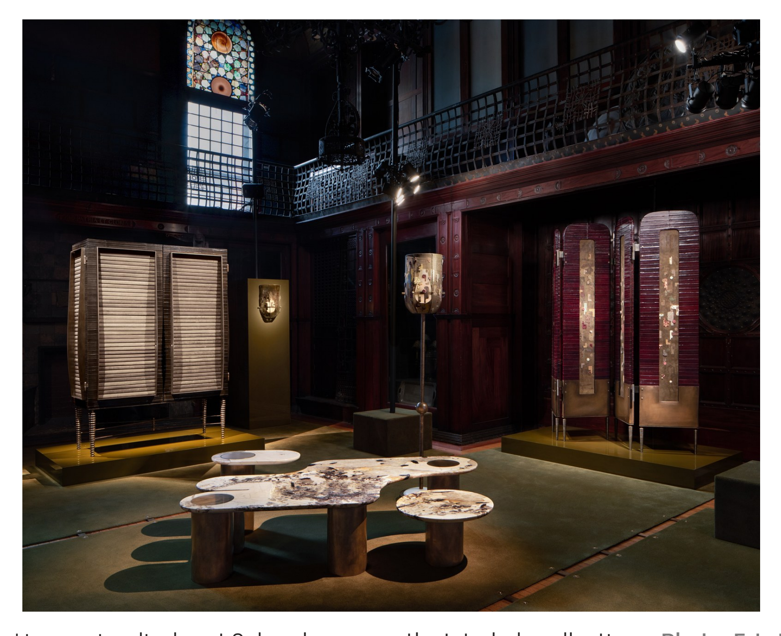
Apparatus' immersive display at Salon showcases the Interlude collection.

One of Salon's trademarks is the immersive environments that the exhibitors are encouraged to create inside the capacious Drill Hall, contextualizing the works in both familiar and dreamlike settings of their own making. There's a lot to take in, so AD PRO has rounded up some of the highlights, on view until Salon Art + Design closes on November 18.