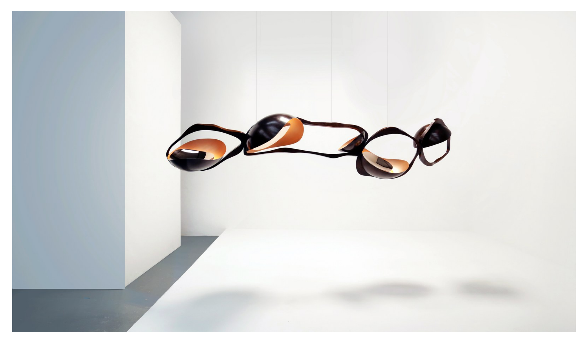
Niamh Barry's bronze and LED Muscularity fixture is shown at Maison Gerard.