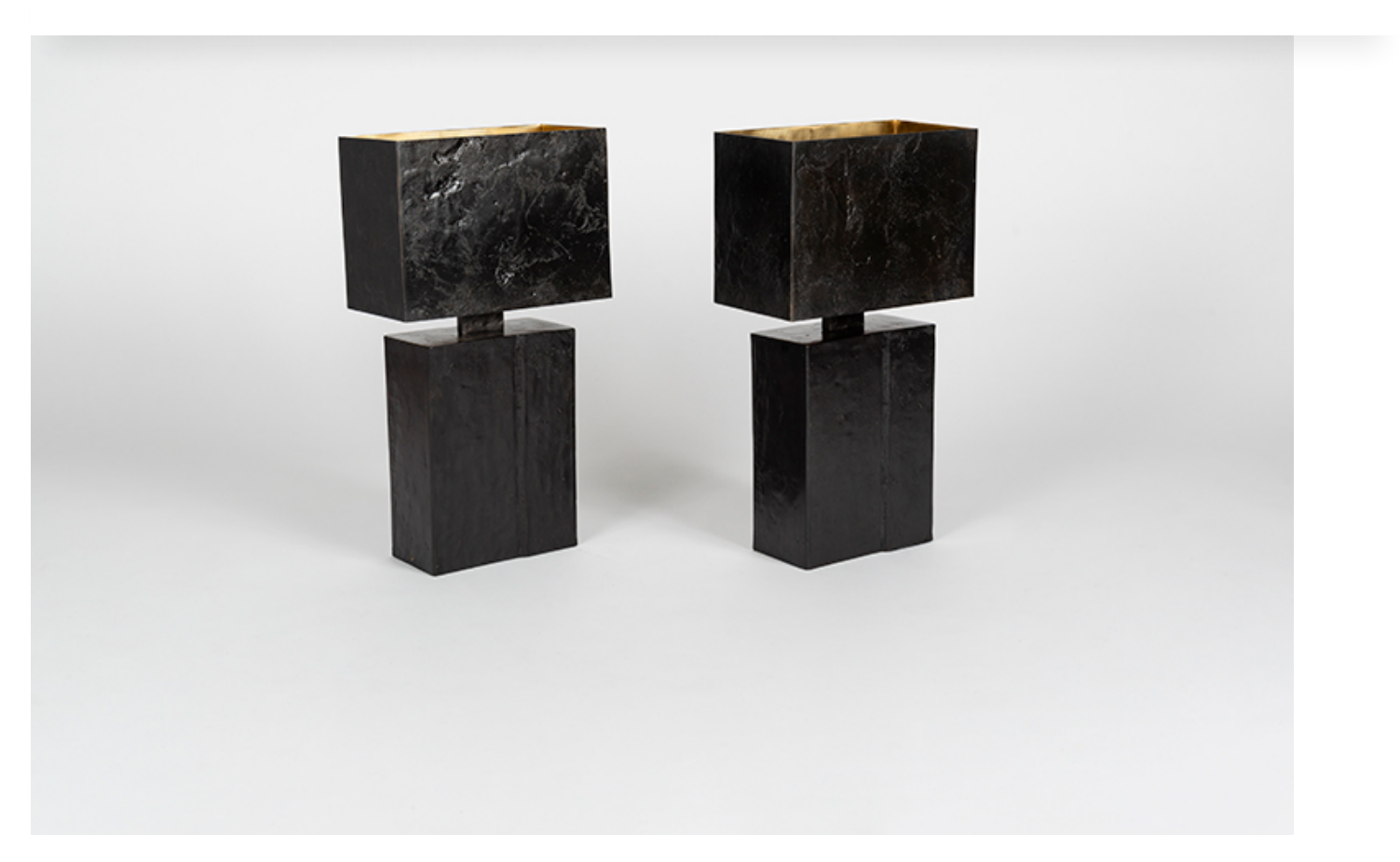
Vahan table lamps by Aline Hazarian.