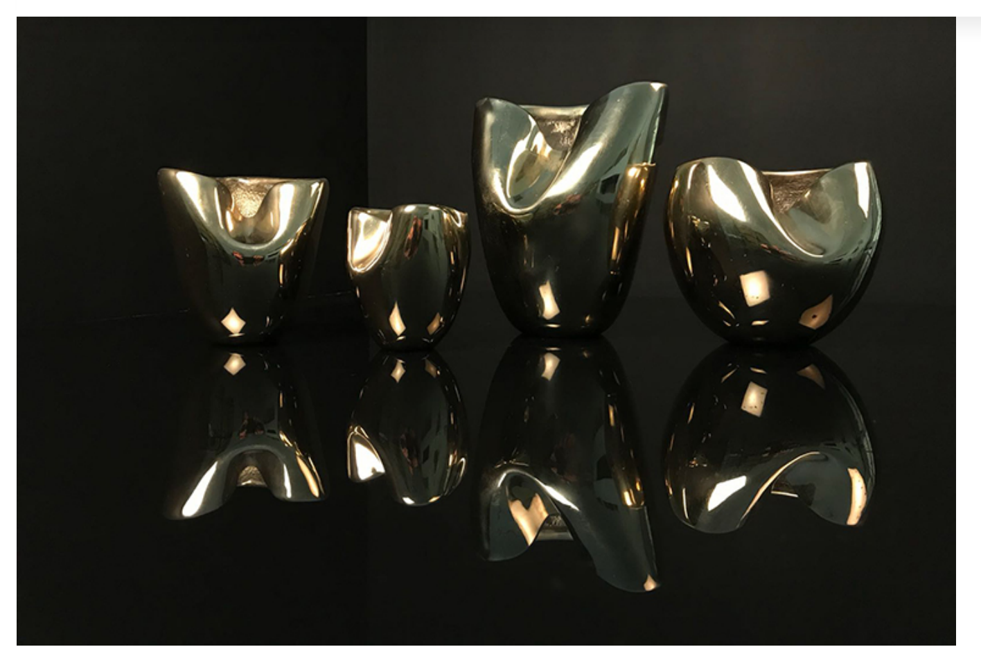
Heart vases by Jaimal Odedra.