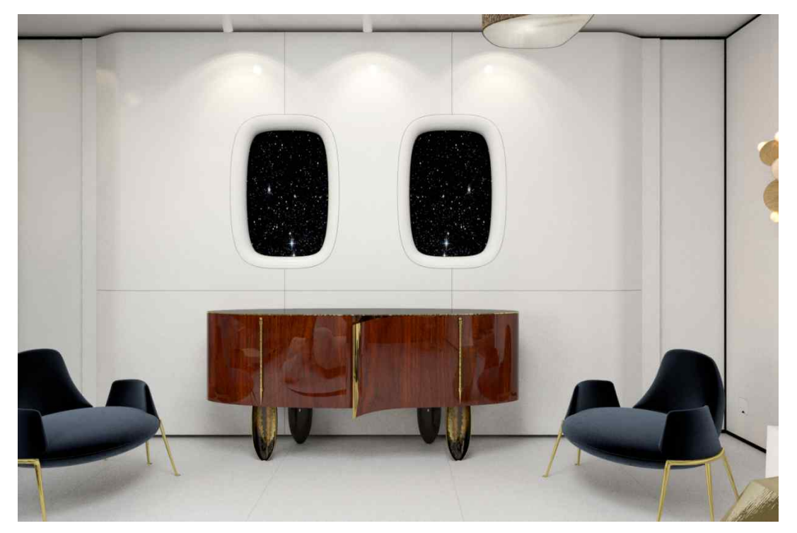
Papilla armchairs, €20,400. Roma cabinet, €98,400

Several of Salvagni's most iconic pieces furnish the futuristic scene. His six-arm Spider White chandelier (€86,400) in patinated cast bronze and backlit onyx hovers like a UFO over the main space, and in the connecting room two monolithic side tables – the multifaceted Emerald (€14,400) and the illuminated onyx Menhir (€26,400) – are arranged in such a way that they appear as if they have fallen to earth from the depths of outer space.