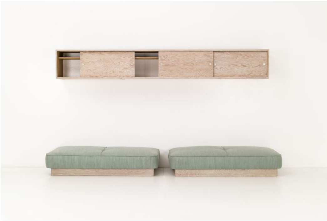
Albert Frey floor cushions and wall mounted cabinet