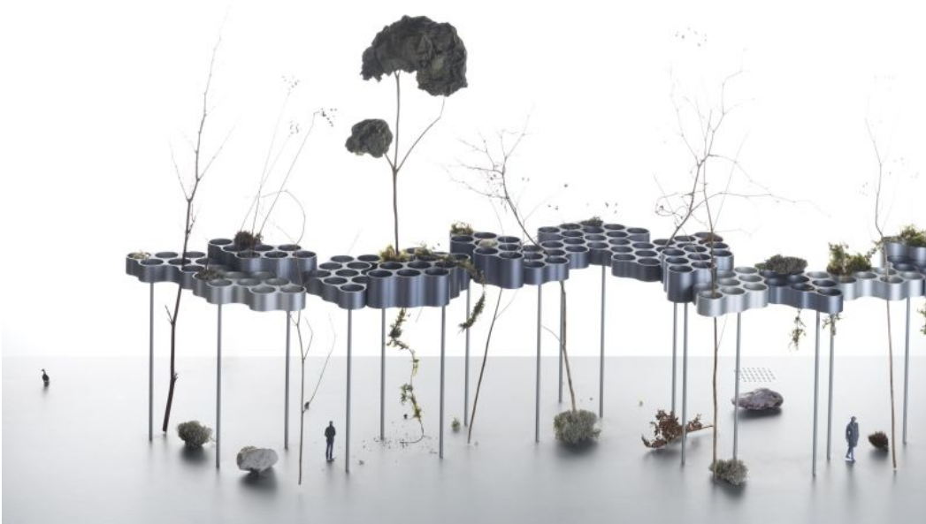
Nuage by Ronan & Erwan Bouroullec Credit: Courtesy of Nuage Ronan & Erwan Bouroullec and Miami Design District

Outside of the fair tent, in the Miami Design District, the French design team have dreamed up a pergola that will be installed on Paseo Ponti. The fluid structure will be nestled between the existing architecture of the area, offering shade and shelter to passersby.