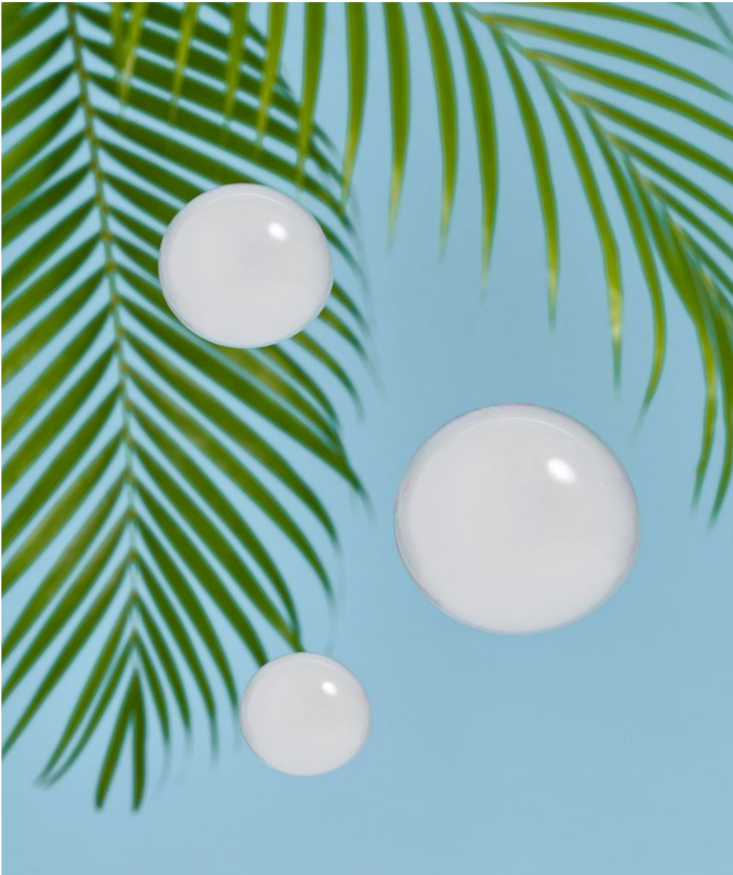
'New Spring' by Studio Swine x COS Credit: Studio Swine

The Design Miami fair runs Dec. 6-10, 2017