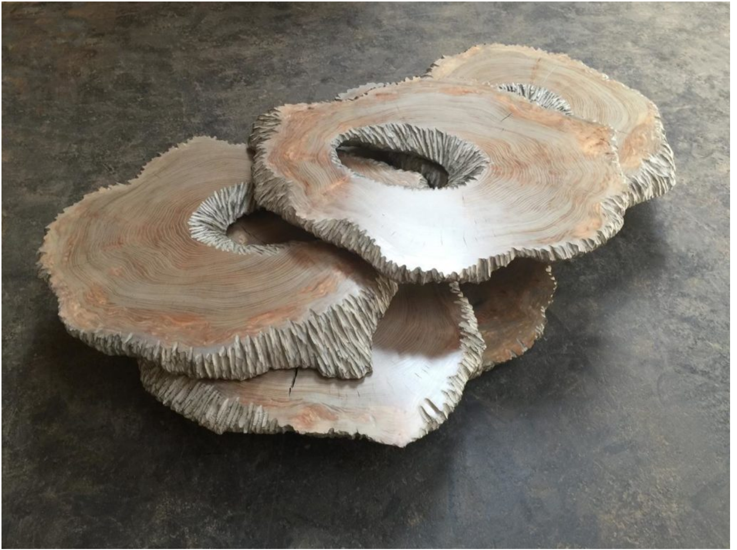
Stefan Bishop's Agaricus Coffee Table.