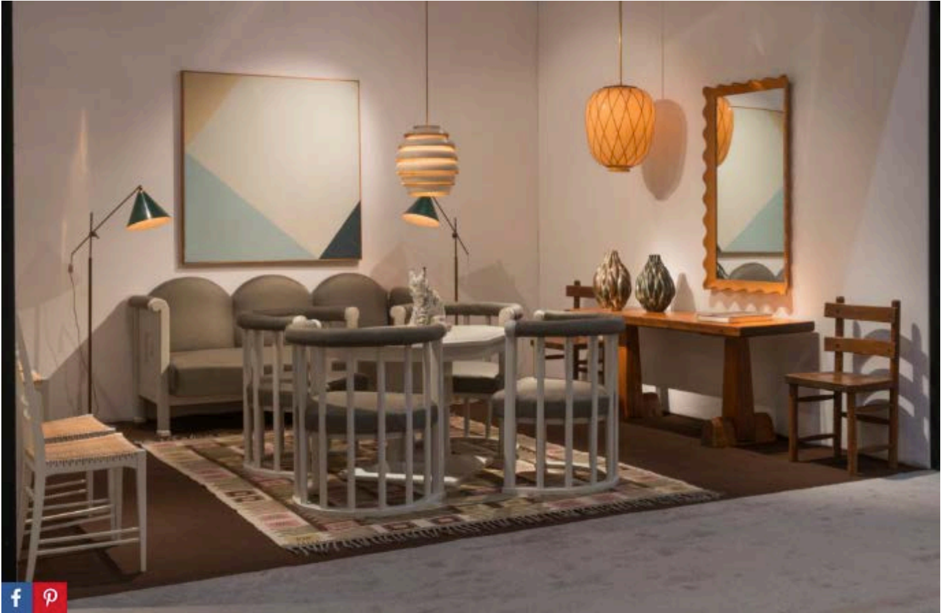
Eliel Saarinen's suite.