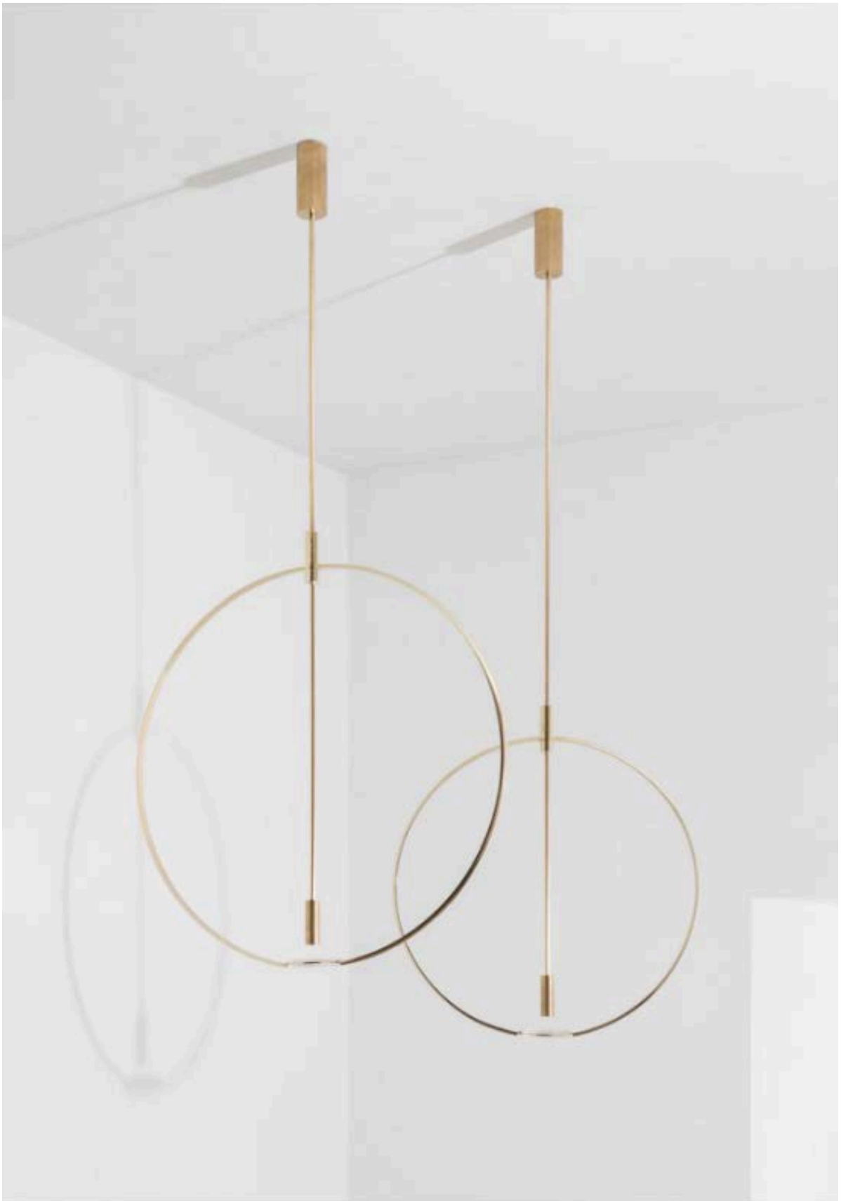
Magnifier Ceiling Lamp by Formafantasma.