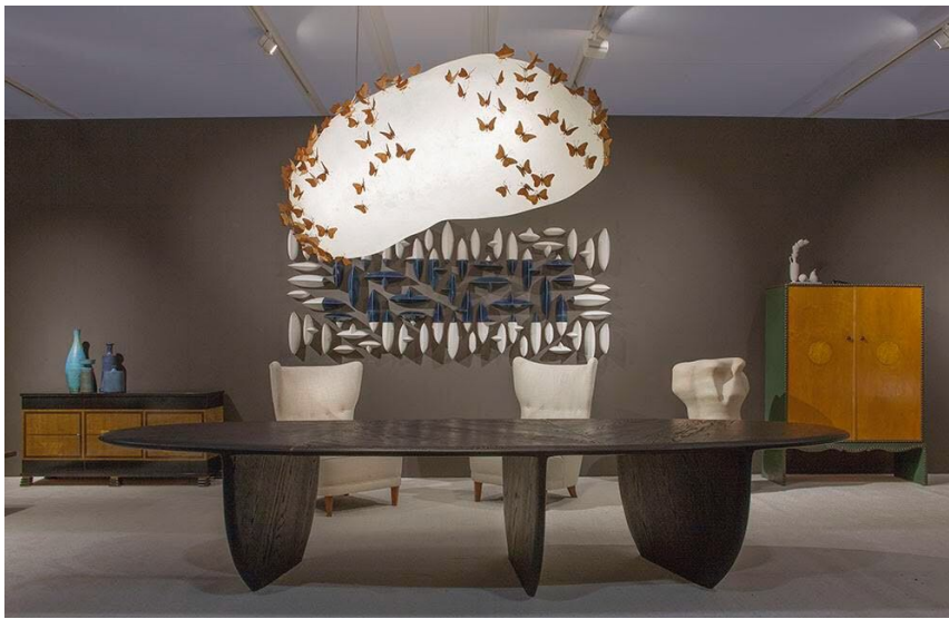
Gal Gaon's Pebble Table.