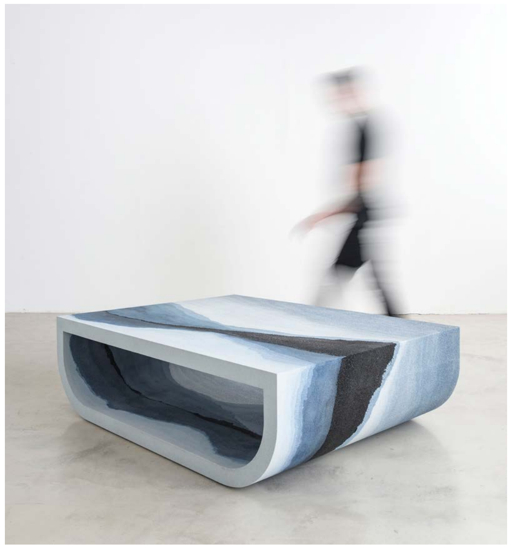
Coffee table from Escape .

Escape 's crystalline tactility is forged through a fusion of sand, silica, and powdered glass. Silica's lava-like texture mixes with hand-dyed sand to suggest geological layers and distant skylines. Cast-powdered glass also lends luster. " Escape marks the beginning of a love affair with powdered glass," Mastrangelo says. "It provides such a wide array of options when it comes to casting, texture, durability, color, and translucency."