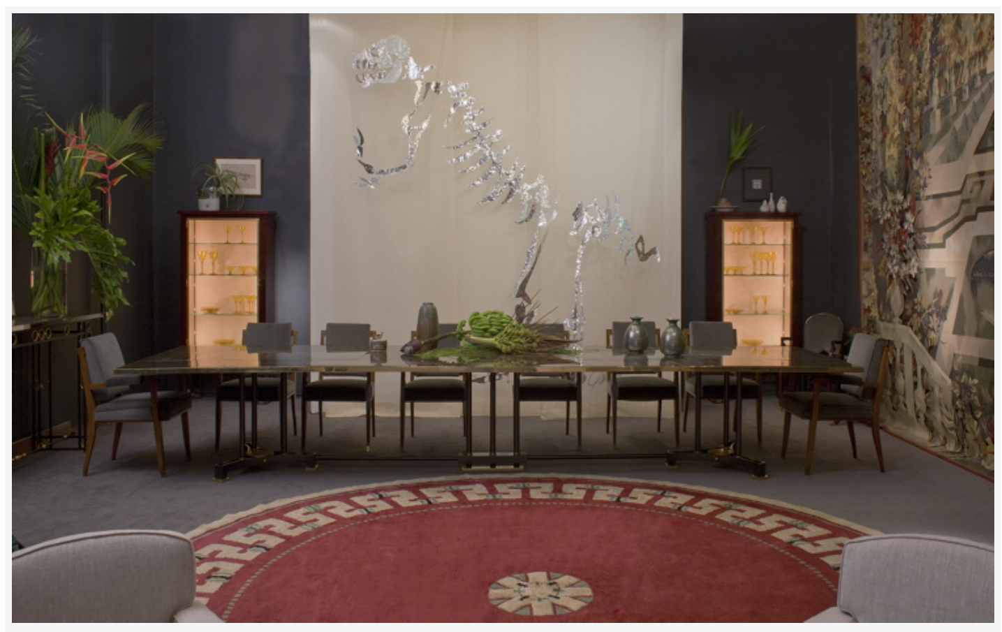
The Maison Gerard Gallery

The East Village, my neighborhood for 23 years. It's a charming and authentic community with an intimate feel within the big city.