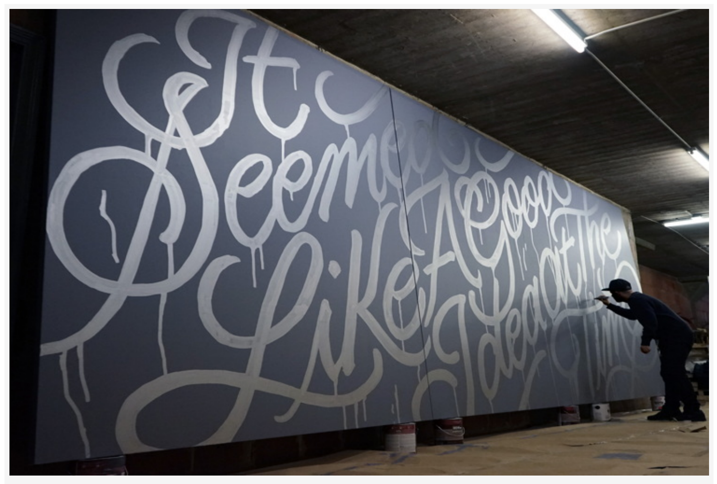
The Faust mural in progress.