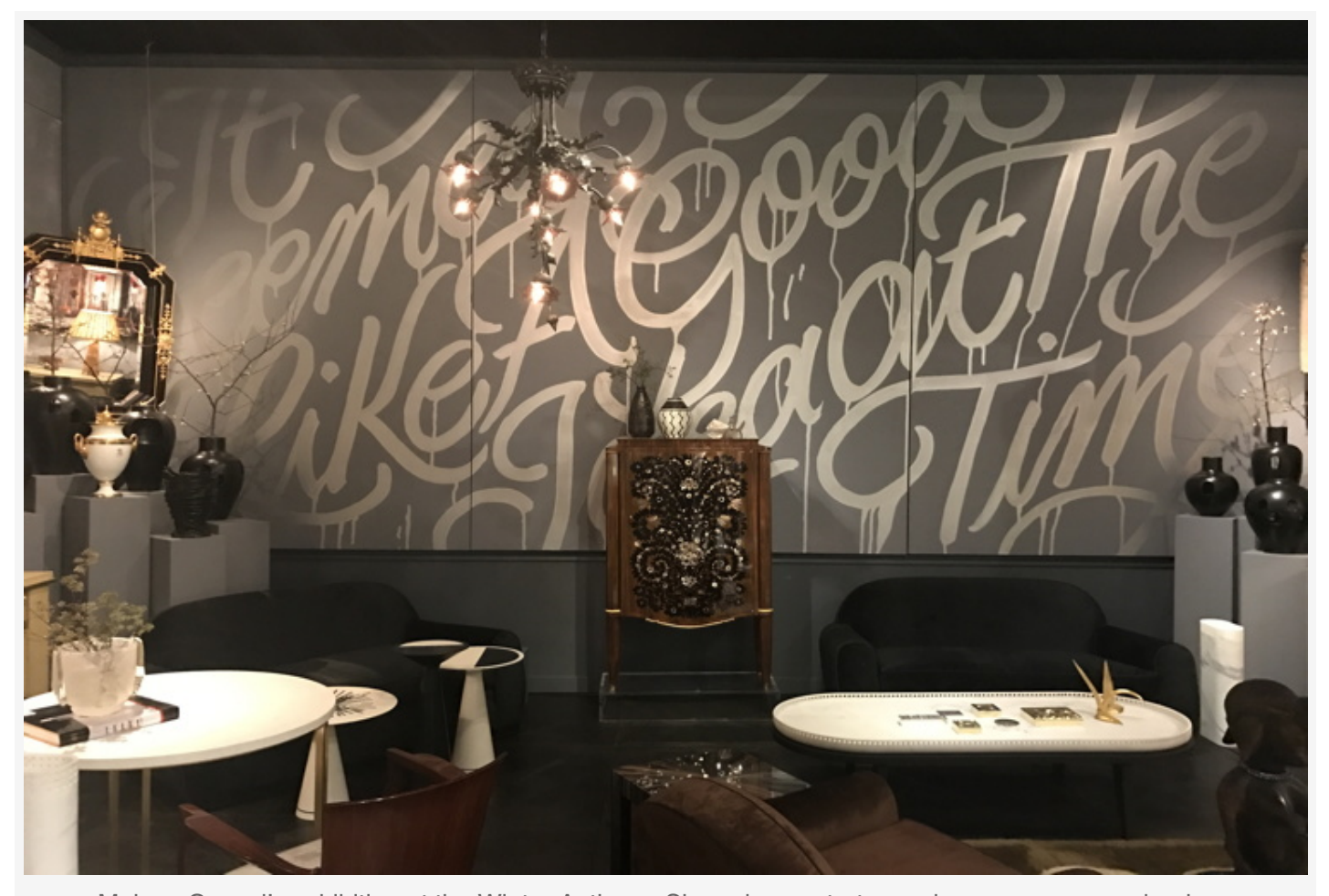
Maison Gerard's exhibition at the Winter Antiques Show demonstrates a glamorous new modernism.