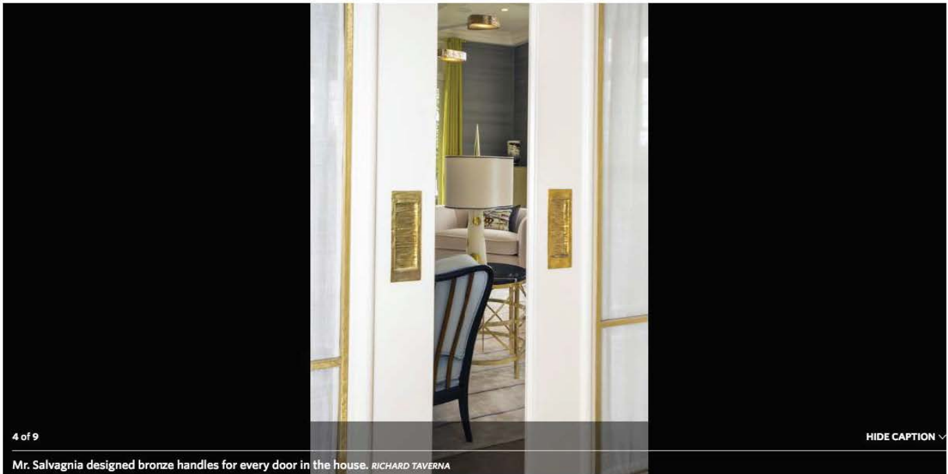
4 of 9 HIDE CAPTION Mr. Salvagnia designed bronze handles for every door in the house. RICHARD TAVERNA