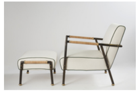
Pinto Paris Lodge ARMCHAIR and FOOTSTOOL France, 2015